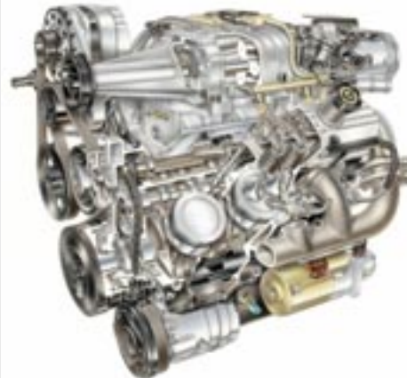
Supercharged 3800 V6 Engine