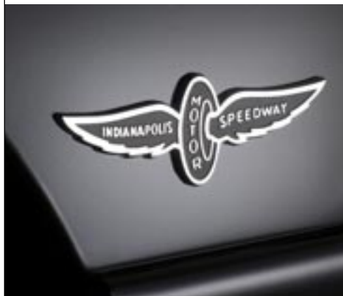
Black Exterior with “Indy” Badging