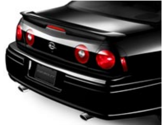
Rear Spoiler and Bright Stainless-Steel Exhaust Tips