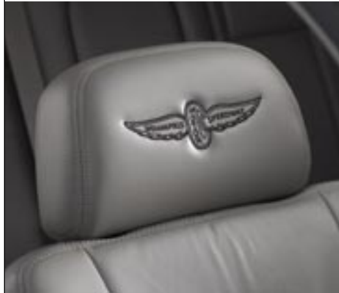
Head Restraints with “Indy” Embroidery