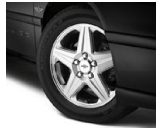
17-Inch Chrome Wheels

The Winged-Wheel logo, Winged-Wheel Flag logo, INDY, INDIANAPOLIS MOTOR SPEEDWAY, INDIANAPOLIS 500 and INDY 500 are registered trademarks of Brickyard Trademarks, Inc., used with permission. Chevrolet, Impala and the Impala Emblem are registered trademarks and Chevy is a trademark of the GM Corp. ©2004 GM Corp.