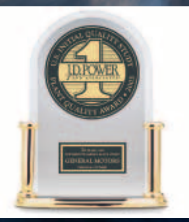
Built with pride at Oshawa #1, Ontario – recipient of the J.D. Power and Associates Gold Plant Quality Award, North/South America.'

With a 240-hp supercharged 3800 V6 engine, performanceRace-inspired brake cooling ducts help direct air onto thesuspension and race-inspired design, this powerful machinefront brake rotors and calipers for cool operation and tois everything you expect a supercharged Super Sport to be.increase brake pad life.