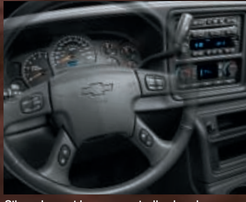
Silverado provides ergonomically placed gauges The Vortec 5300 V8 engine is standard in Silverado for easy viewing. LT trim level shown with available features.