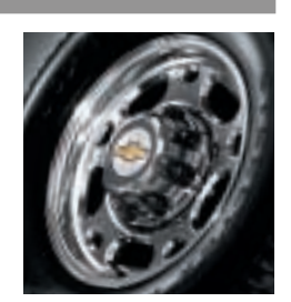
16-INCH LS AND LT THREE- QUARTER-TON EIGHT-LUG, POLISHED FORGED-ALUMINUM WHEEL WITH BRIGHT CHROME FINISH CENTER CAPS