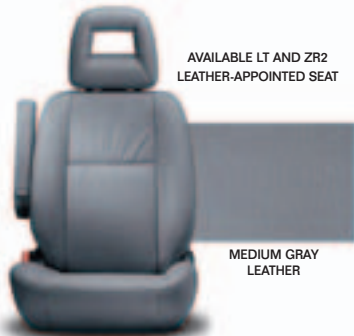
AVAILABLE LT AND ZR2 LEATHER-APPOINTED SEAT