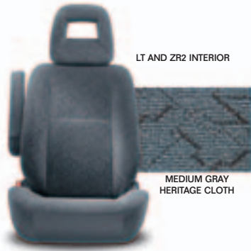
LT AND ZR2 INTERIOR