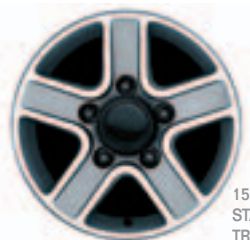
15" ALLOY WHEEL. STANDARD ON TRACKER AND TRACKER LT MODELS.