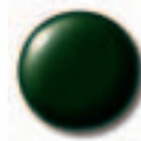
DARK GREEN METALLIC