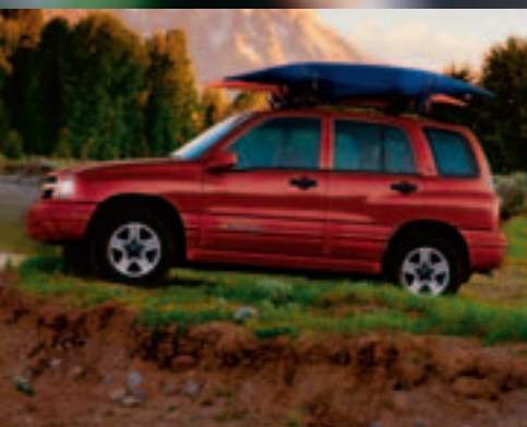
Tracker 4x4 in Wildfire Red shown with available GM Accessories.