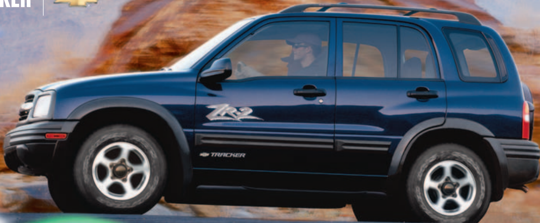
2004 Chevy Tracker ZR2 4x4 in Indigo Blue Metallic shown with optional equipment.