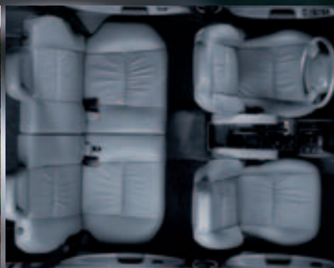
Tracker interior in Medium Gray with available leather-appointed seats.