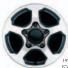
15" ALLOY WHEEL. STANDARD ON ZR2 MODEL.