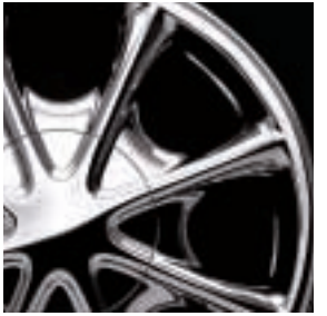
16" Chrome-plated aluminum wheel.