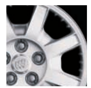
16" Deluxe wheel cover. Standard on CX base models.