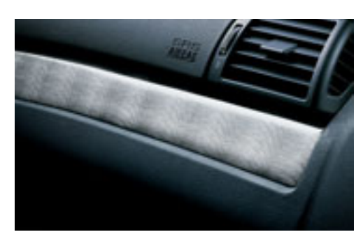
Aluminum Brushed Columns interior trim is a handsome, no-cost option.