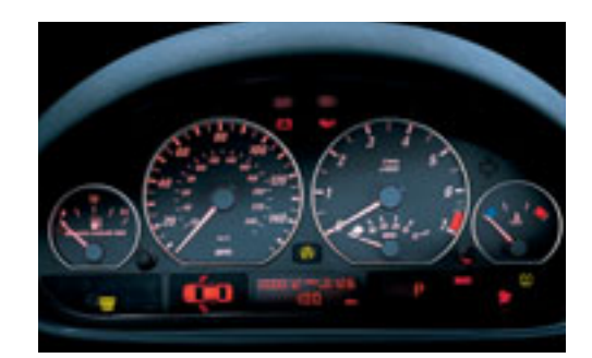
Titanium-finish ringed gauges distinguish the interior of the 330Ci from the 325Ci, while adding a high-tech look. (330Ci only)