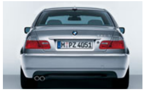
Rear apron: The rear apron, with its integrated diffuser, upgrades the car's aerodynamics.