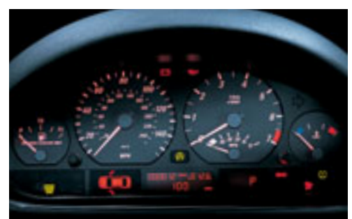
The instrument panel presents all important information at a glance through analog gauges and LCD readouts. When parking lights or headlights are on, the gauges are lit in an easy-to-read red.