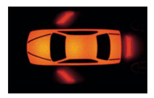
Check Control monitors important data, such as brake fluid and oil levels, whether lights are functioning properly, and all vehicle systems. Any problems are clearly indicated on the pictogram or beside it, in order of importance.