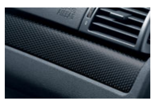
Aluminum Black Cube interior trim: The black aluminum cube interior trim makes for a more sporty, high-tech interior. Silver Cube interior trim is also available as a no-cost option.