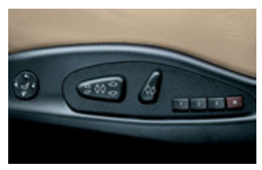
Eight-way Power front seats include a driver's seat and mirror memory system, which lets up to three drivers set their preferred seat and exterior mirror positions. (Plus, the passenger's-side mirror tilts down when vehicle is shifted into reverse gear.) (330Ci; optional and included in 325Ci Premium Package.) Lumbar support [shown] is included in 330Ci and 325Ci Premium Package)