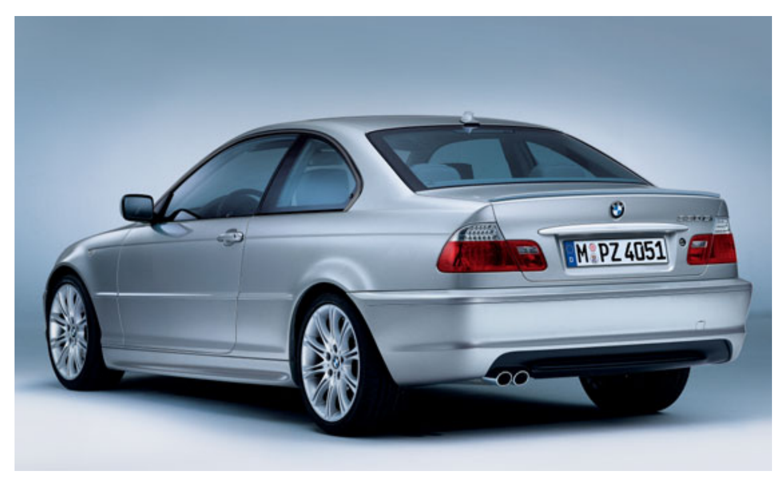
Clean lines, throaty sound. The exhaust has been specially tuned to emit a distinctly more assertive sound than the standard 330Ci Coupe. This lusty growl is conducted through two handsome matte stainless steel, 35mm exhaust tips, which are set into a sleek, new rear apron.