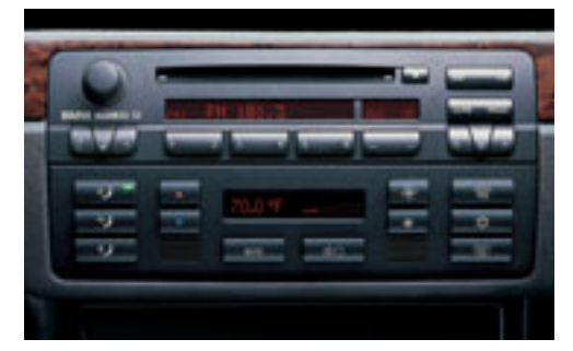
BMW anti-theft AM/FM stereo/CD/MP3 audio system produces full, rich sound through 10 speakers. Includes Radio Data System (RDS), Auto-Store; pre-wired for a BMW six-disc CD player/changer¹ and compatible with auxiliary audio input adapter¹ for audio connection of portable music players, standard. (325Ci; Harman Kardon stereo system standard in 330Ci)