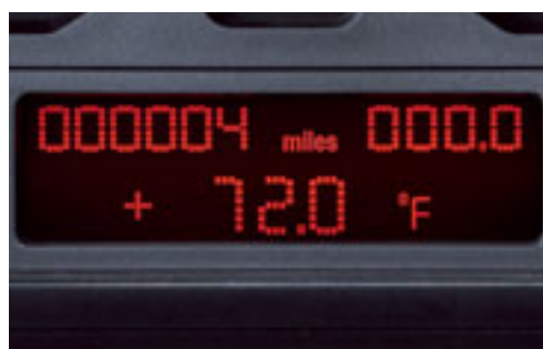
An on-board computer offers valuable travel information, with readouts on expected travel range on remaining fuel, average mpg and average speed. An external thermometer sounds a warning when the temperature falls below 38°F – indicating that the road may ice up.