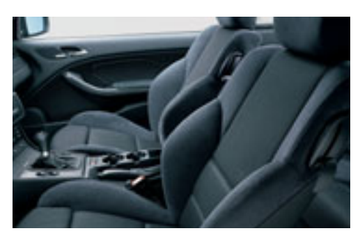
Sport seats: The sport seats provide optimum lateral support while the cloth/Alcantara upholstery adds a dynamic touch. Montana leather is also available for those who prefer the look and feel of all-leather upholstery.