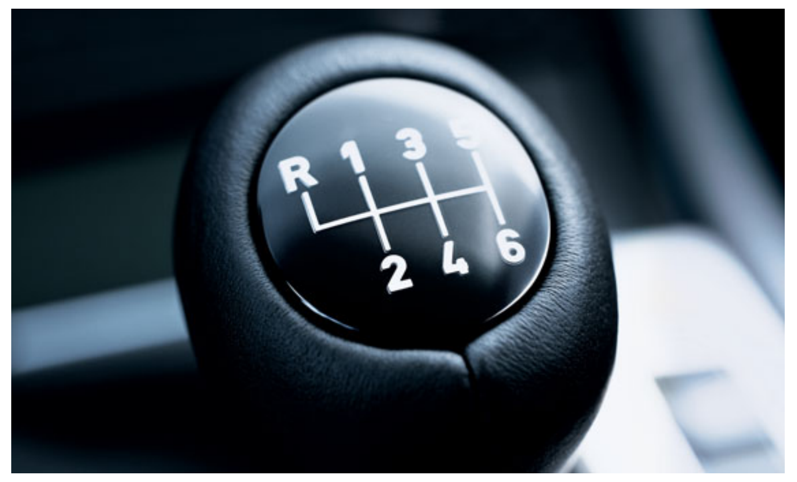
The close shift pattern of the six-speed manual transmission , standard in the 330Ci, delivers a precise, athletic feel for a more dynamic driving experience. (330Ci only) (5-speed manual available in the 325Ci)