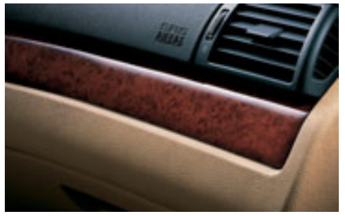
Myrtle Wood trim curves around doors, dashboard and center console, adding a luxurious touch to the interior.