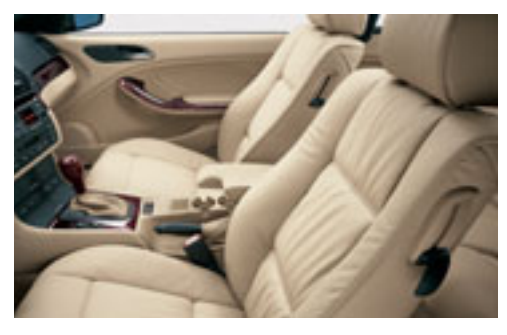
Eight-way adjustable seats (including 2-way headrests) firmly support the driver and front passenger over long distances. Front seat bolsters help eliminate "submarining" during sudden stops. (325Ci; 330Ci has eight-way power seats)