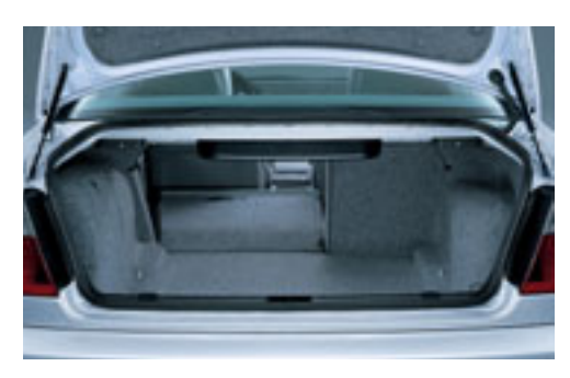
1/3 and 2/3 split-fold rear seats allow you to load long objects in the trunk by folding down one or both rear seats, as needed.