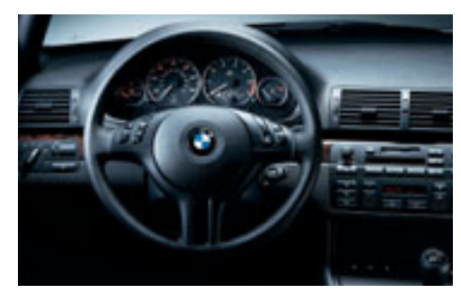
A three-spoke leather-wrapped multi-function sport steering wheel lets you keep both hands on the wheel while adjusting audio settings, cruise control and the accessory phone.