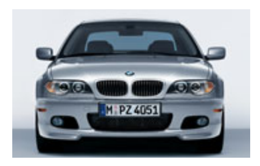
Front air dam that is unique to the Performance Package displays a face that's all business.

The 330Ci Performance Package is a product of BMW Individual – the division responsible for creating unique, limited-edition BMWs. It includes a more muscular engine that boasts 235 hp at 5900 rpm, and 222 lb-ft of torque at just 3500 rpm. To make the most of this extra power, the redline has been increased from 6500 to 6800 rpm. Additional, distinctive exterior and interior features further differentiate the Performance Package from all other 3 Series models.