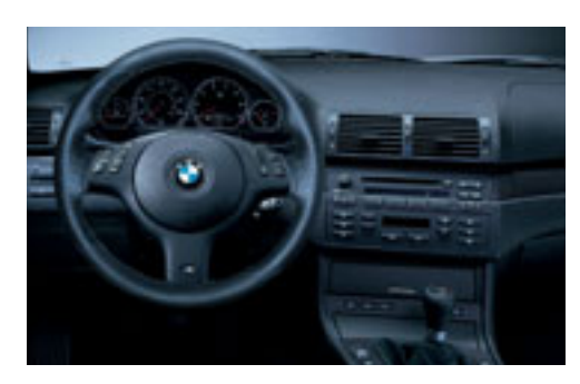
M three-spoke leather-wrapped multi-function sport steering wheel has fingertip cruise, audio and accessory phone<sup>1</sup> controls.