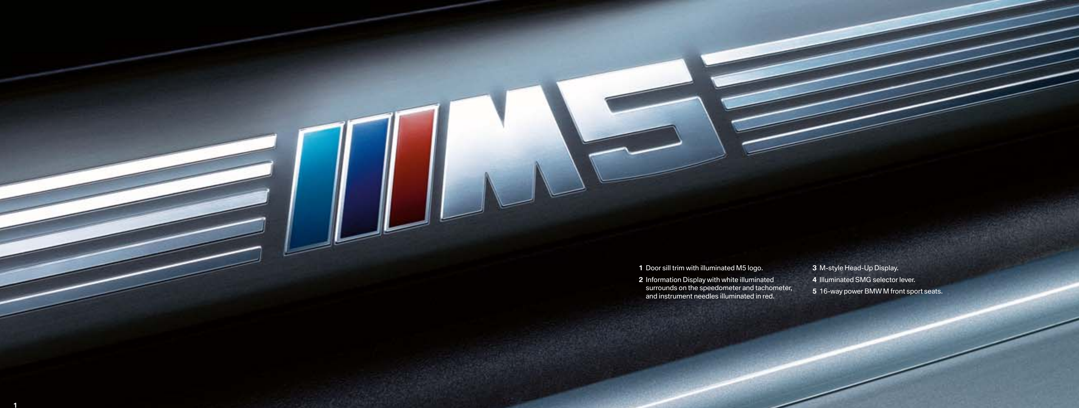
1 Door sill trim with illuminated M5 logo.