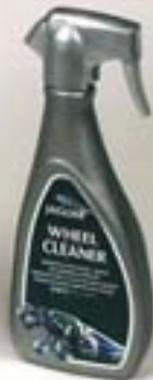
ALLOY WHEEL CLEANER