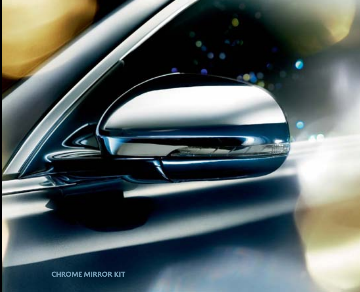
CHROME MIRROR KIT