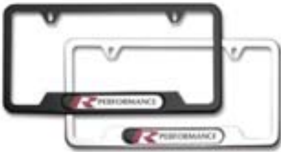
R PERFORMANCE PLATE FRAMES