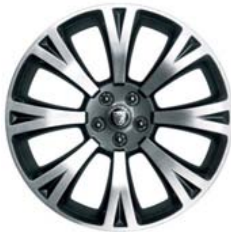
20" ORONA DIAMOND