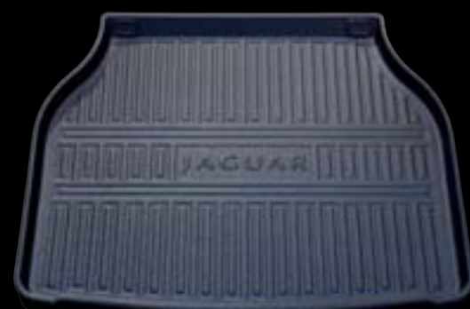
TRUNK FLOOR LINER