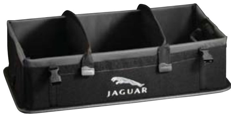
COLLAPSIBLE CARGO CARRIER