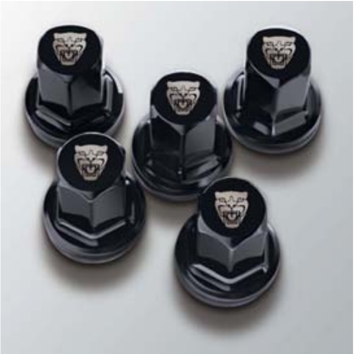
ETCHED WHEEL LUG NUTS