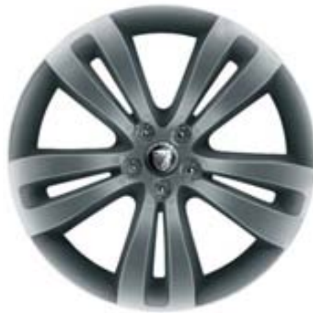
19" TOBA PAINTED