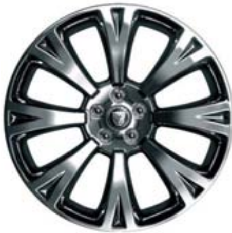
20" ORONA POLISHED