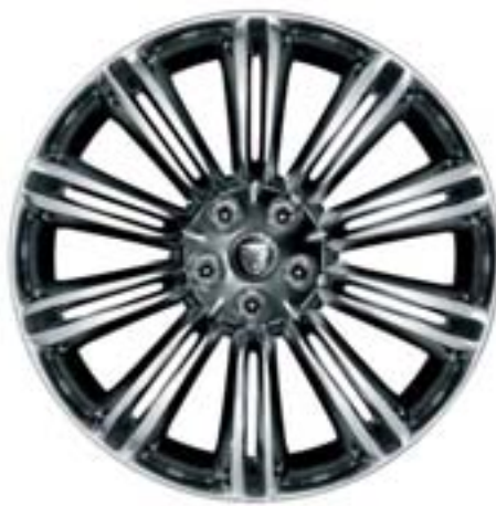
20" KASUGA POLISHED