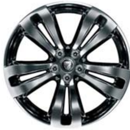
19" TOBA POLISHED