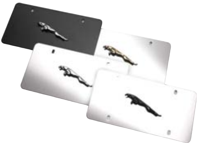
JAGUAR LEAPER PLATES