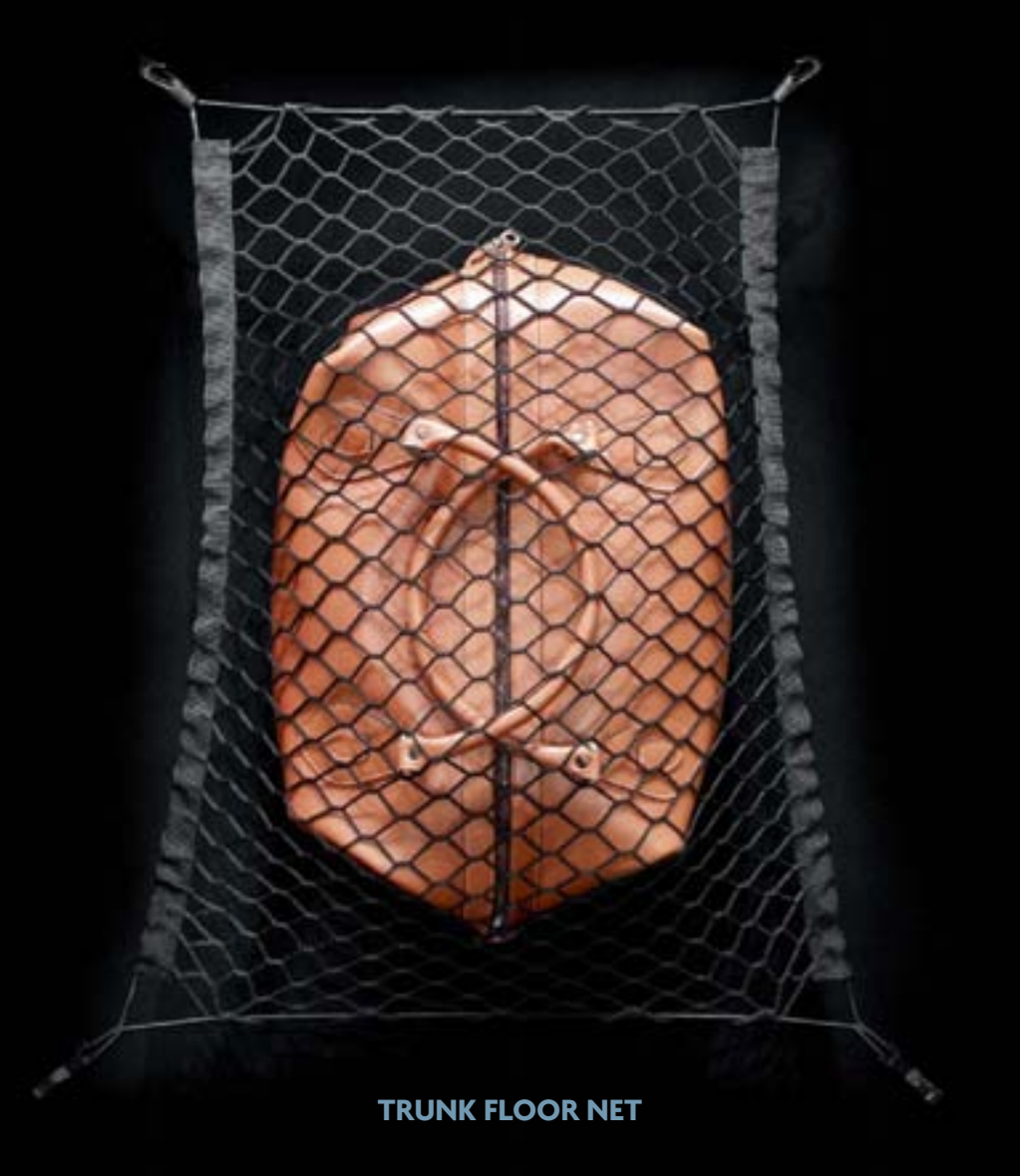
TRUNK FLOOR NET