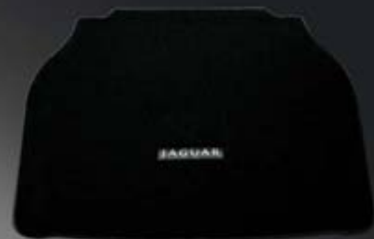
TRUNK CARPET MAT