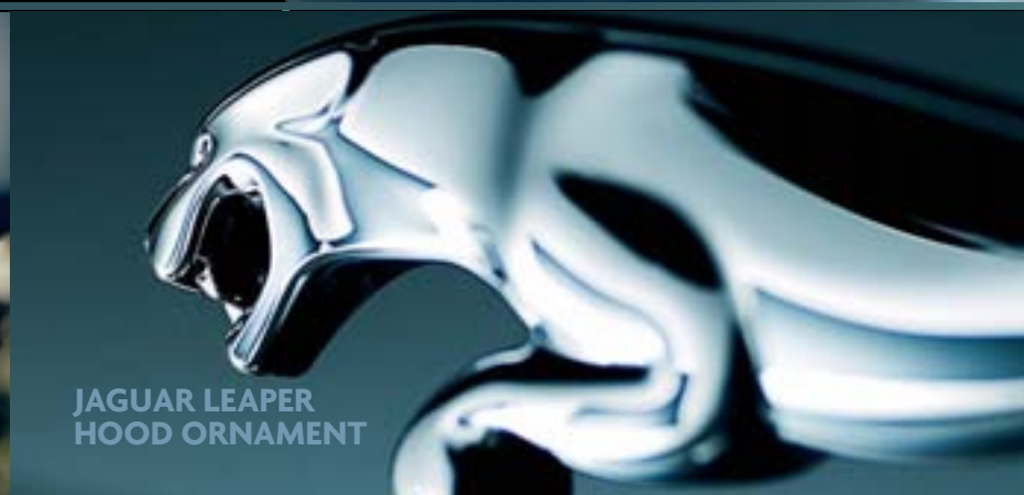
JAGUAR LEAPER HOOD ORNAMENT