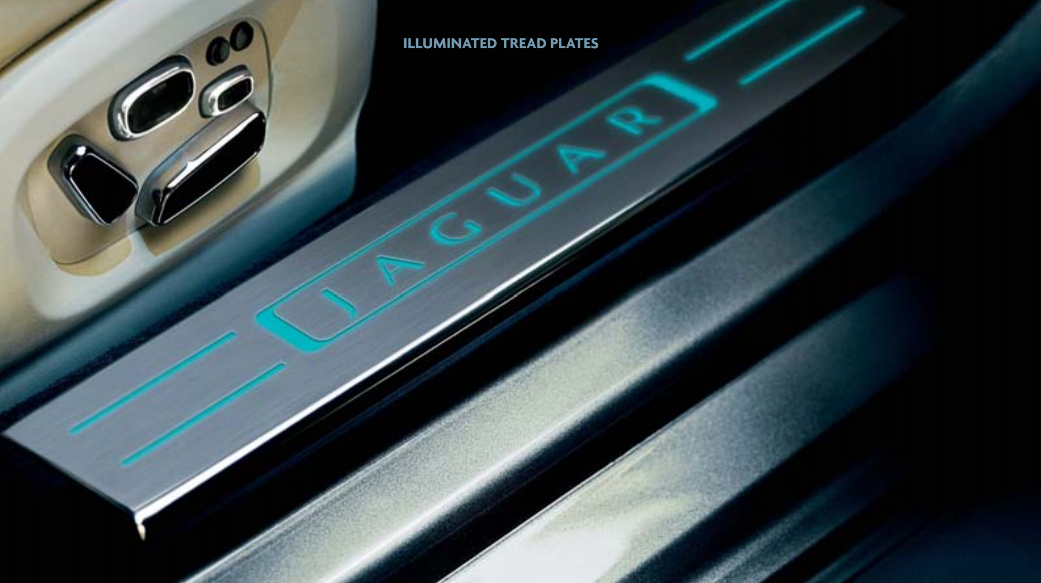
ILLUMINATED TREAD PLATES