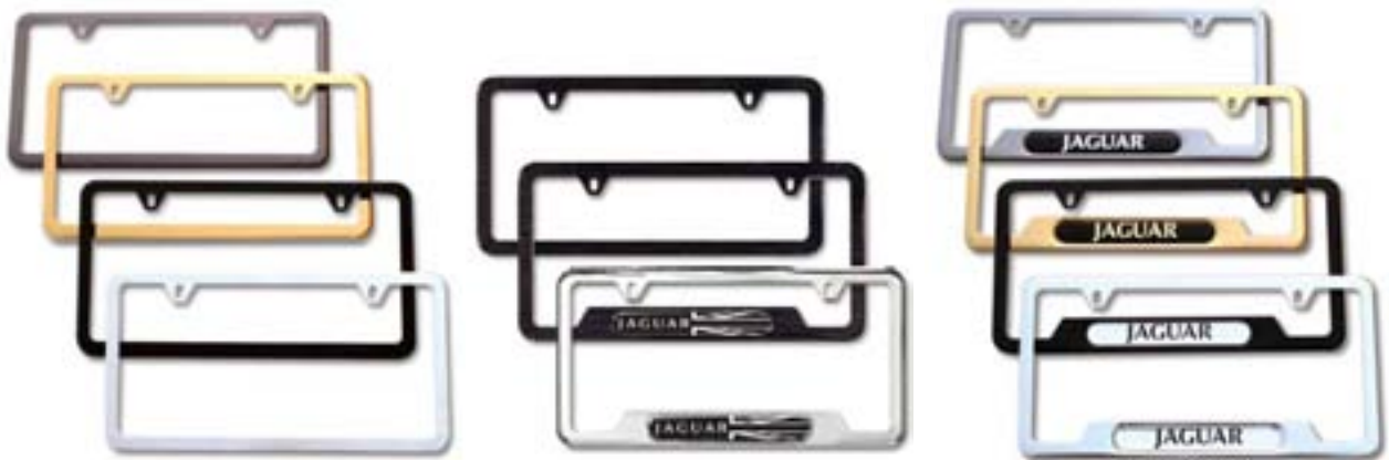
LICENSE PLATE FRAMES (SLIMLINE AND JAGUAR LOGO)