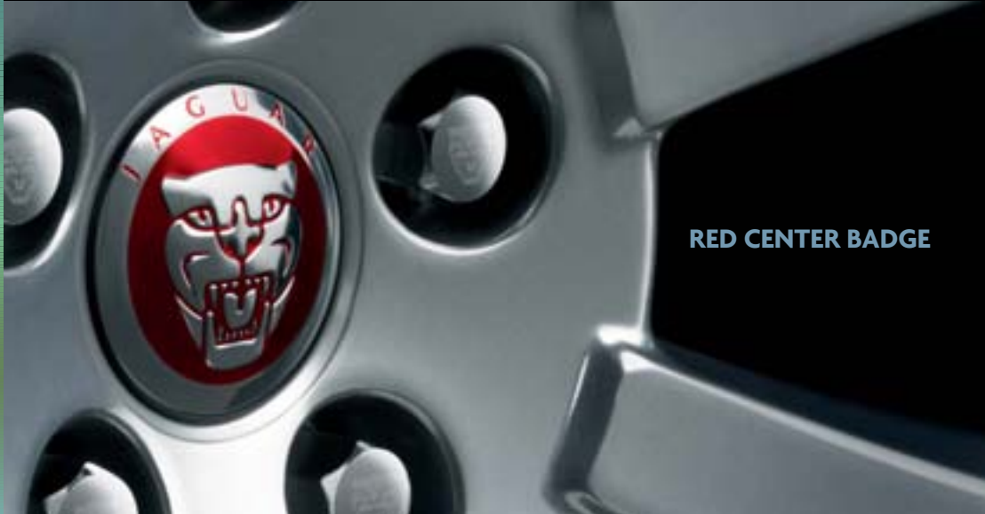
RED CENTER BADGE