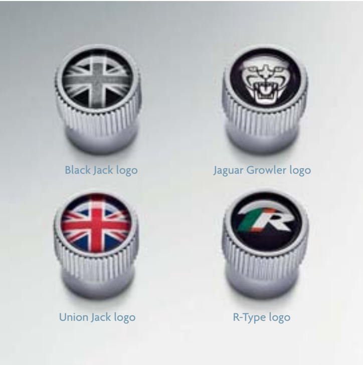
VALVE STEM CAPS