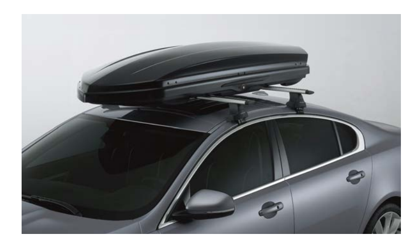
ROOF BOX SPORT