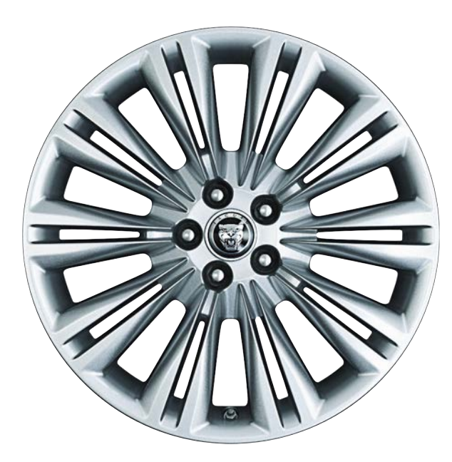
19" CARAVELA FRONT C2Z12613 19" CARAVELA REAR C2Z12614