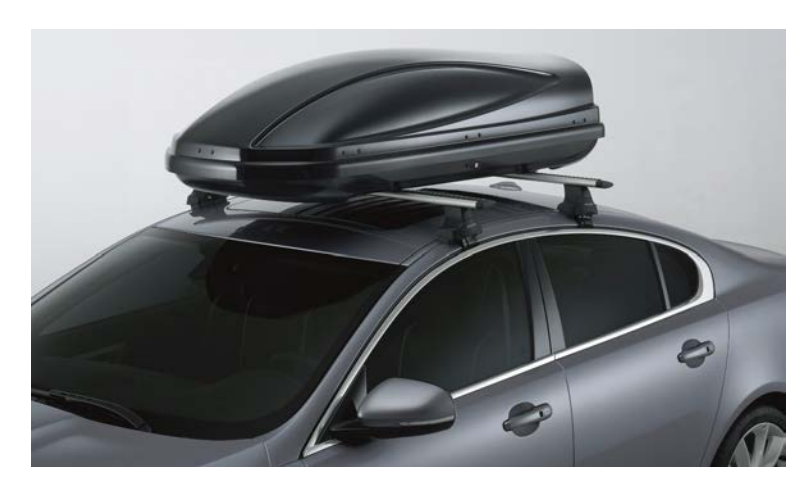
ROOF BOX LUGGAGE