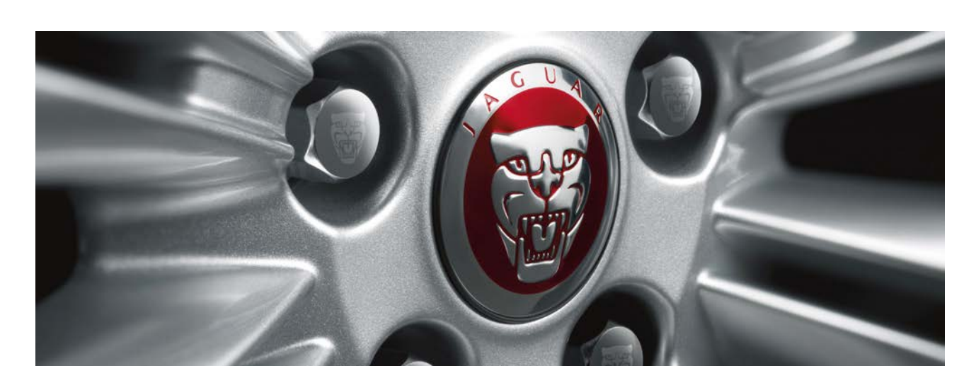
RED CENTER BADGE