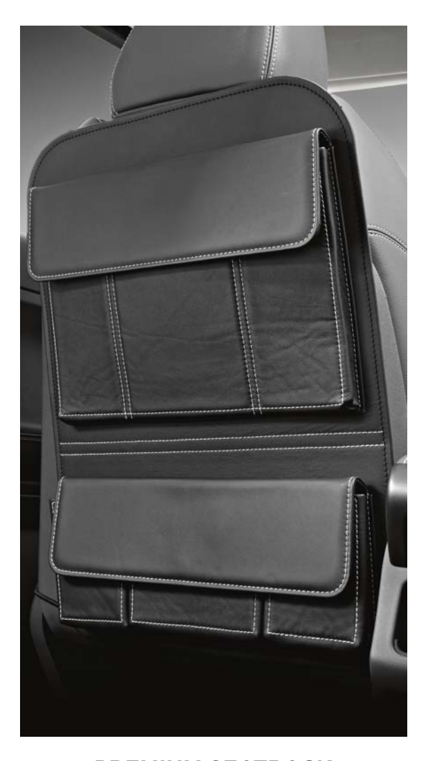
PREMIUM SEATBACK STOWAGE

Fits 2008-11 model year XF models. C2Z11156