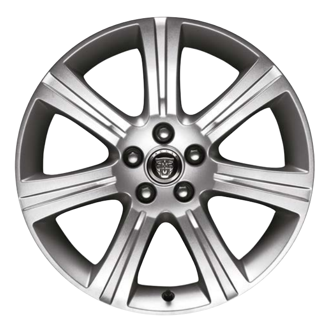
18" VENUS C2Z1010