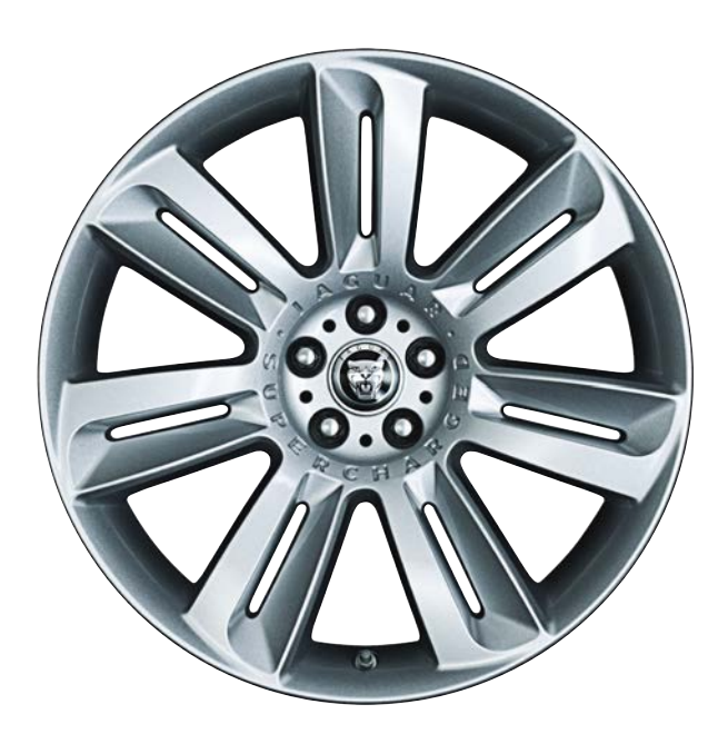
20" NEVIS C2Z4429