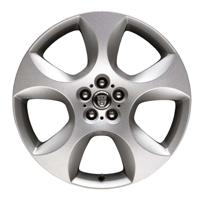
20" VOLANS FRONT C2Z2652 20" VOLANS REAR C2Z2653