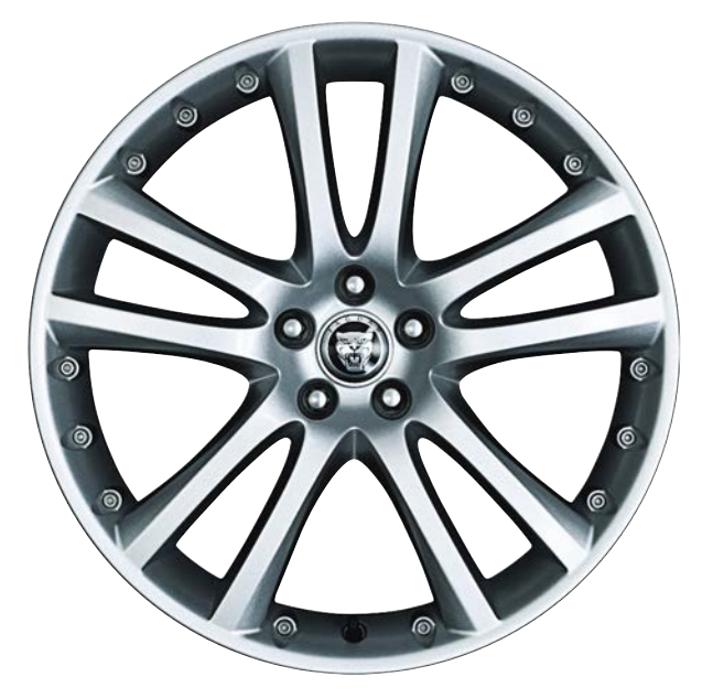
20" SENTA C2Z1014