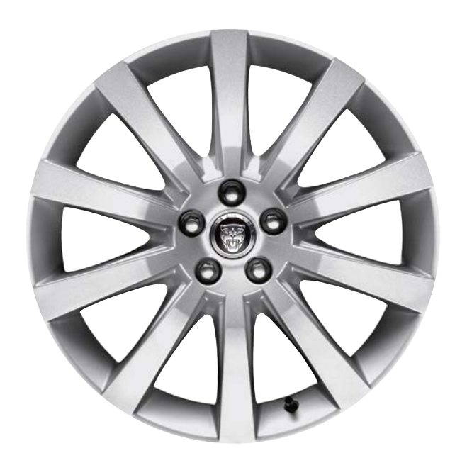
19" CARELIA C2Z12002