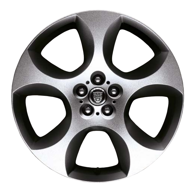
20" VOLANS FRONT SHADOW CHROME C2Z14860 20" VOLANS REAR SHADOW CHROME C2Z14861