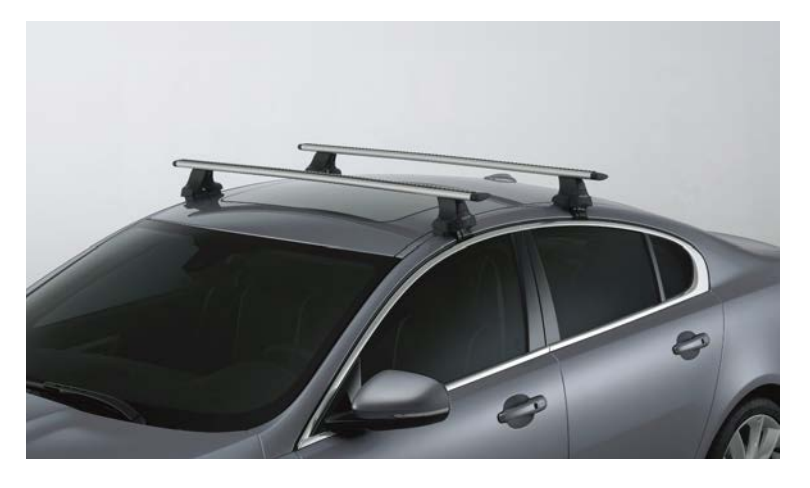
ROOF CROSS BARS

Requires Roof Cross Bars (C2Z2O474). C2Z21730