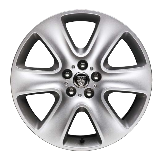
18" CYGNUS C2Z3371