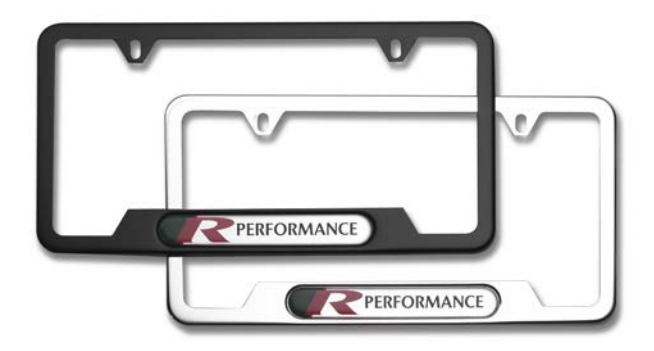
R PERFORMANCE PLATE FRAMES