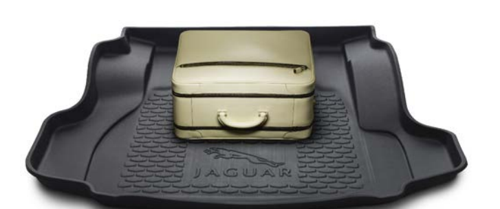
TRUNK UTILITY MAT