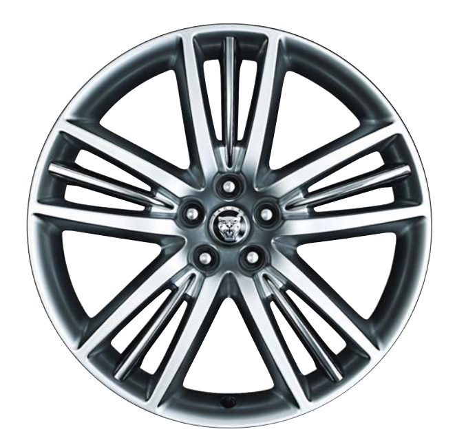
20" SELENA C2P14975

ENHANCE THE STRIKING APPEARANCE of your XF with a set of sporty alloy wheels. Both attractive and durable, these alluring accessories help make your XF your own. Thoughtfully engineered by Jaguar specialists, the wheels meet the same exacting standards as your vehicle's standard wheels while complementing the vehicle's beautifully sculpted proportions.