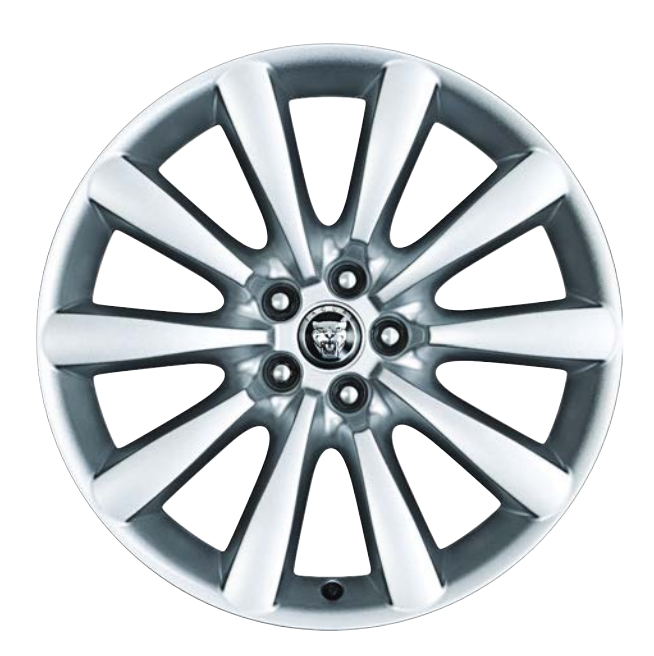
19" ARTURA C2Z14209