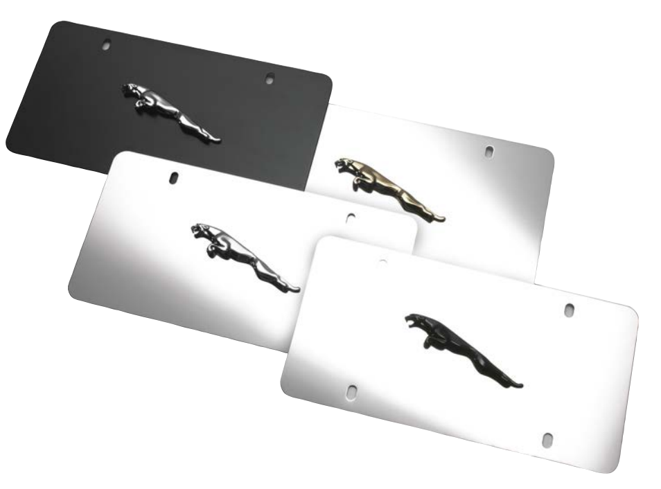
JAGUAR LEAPER PLATES