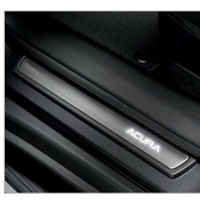
DOOR SILL TRIM— ILLUMINATED