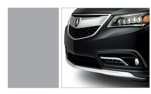
SPORT BUMPER TRIM— FRONT

For over a decade the Acura MDX has been the luxury SUV gold standard. So it's no surprise that this newest edition takes that leadership even further. More cuttingedge technology, more room, more fuel economy, more of everything that made it the benchmark. And now you can add your own touches with Acura Genuine Accessories that personalize it, protect it, and simply make it even more convenient. An unparalleled opportunity.