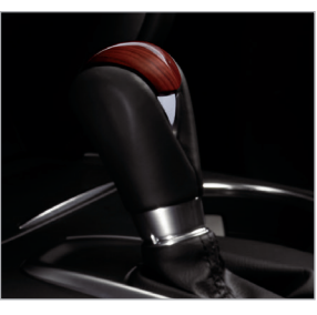
SHIFT KNOB—WOODGRAIN-LOOK & LEATHER