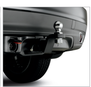
TRAILER HITCH, TRAILER HITCH BALL