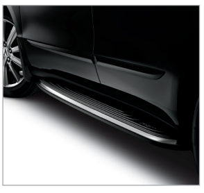
RUNNING BOARDS— ADVANCE