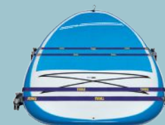
SURF AND PADDLE BOARD CARRIER (1)(2) [TCSSUP811]