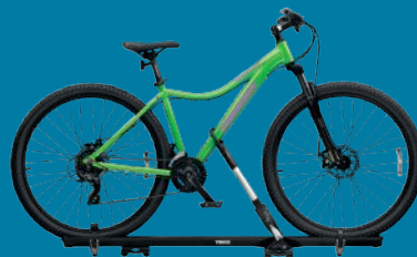
UPRIGHT BIKE CARRIER (1)(2) [TCOES599]