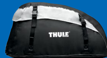
CARGO BAG (1)(2) [82207198 – 11 cu ft] [TCINT869 – 16 cu ft]