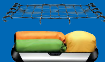
CARGO BASKET (1)(2) [TCTRL864] CARGO BASKET NET (1)(3) [82209422AB]