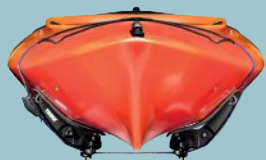
KAYAK CARRIER (1)(2) [TCKAY883]