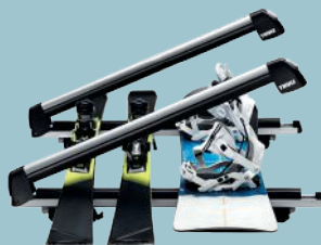
SKI AND SNOWBOARD CARRIER (1)(2) [TCS92725]