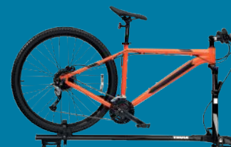
FORK-MOUNT BIKE CARRIER (1)(2) [TCFKM526]