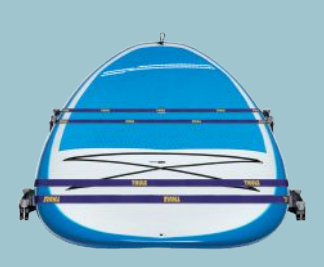
SURF AND PADDLE BOARD CARRIER<sup>(1)(2</sup> [tcsupr11]