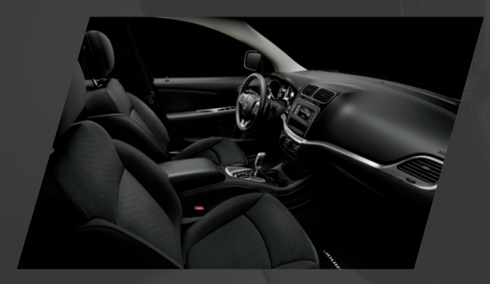
Cloth – Black Standard on CVP