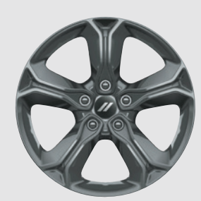
19-inch Black aluminum wheel Standard on Crossroad