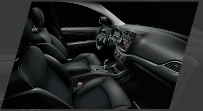
Leather-faced with Sport mesh inserts – Black with Light Grey accent stitching Standard on Crossroad