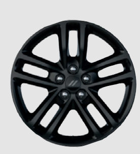
17-inch Black aluminum wheel Available on CVP with Blacktop Package