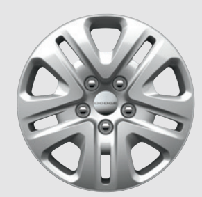
17-inch steel wheel with wheel cover Standard on CVP