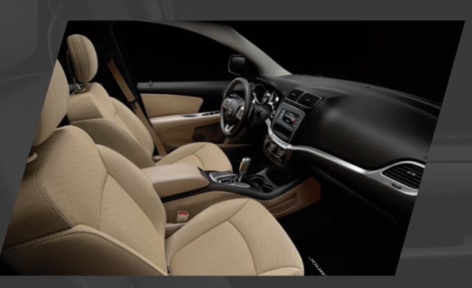
Cloth – Light Frost Beige Standard on CVP