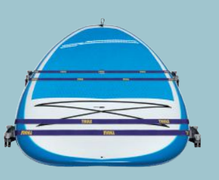
URF AND PADDLE BOARD CARRIER<sup>(1)(2)</sup>