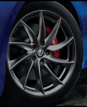
18-inch Dark Turbine aluminum wheels Available on Sprint