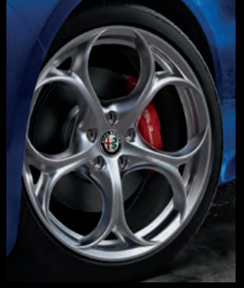
19-inch Bright 5-hole aluminum wheels Standard on Ti Sport