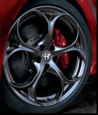
19-inch Dark 5-hole aluminum wheels Available on Quadrifoglio