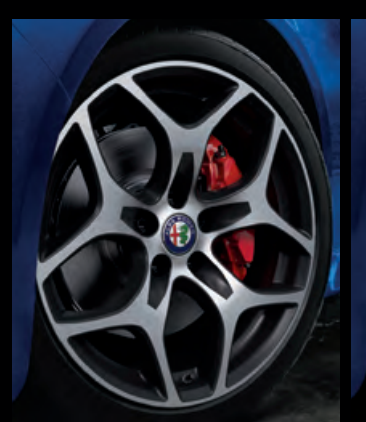
18-inch Bright Double Y-spoke aluminum wheels Standard on Ti