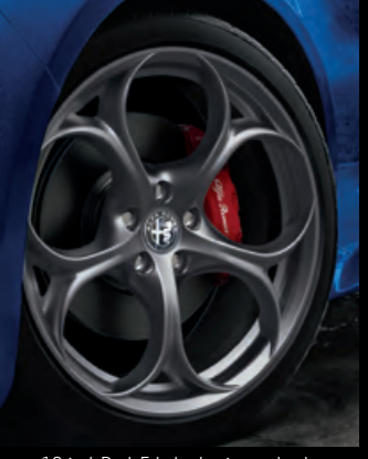
19-inch Dark 5-hole aluminum wheels Standard with Nero Edizione Package on Ti Sport