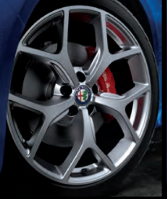
19-inch Bright Y-spoke aluminum wheels Available on Ti