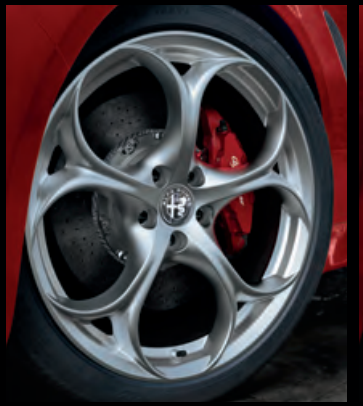
19-inch Bright 5-hole aluminum wheels Available on Quadrifoglio