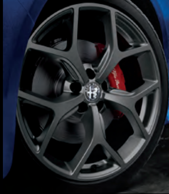
19-inch Dark Miron Y-spoke aluminum wheels Included with Nero Edizione Package on Ti