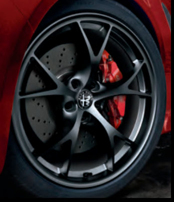
19-inch Dark Tecnico aluminum wheels Available on Quadrifoglio