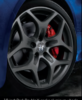
18-inch Dark Double Y-spoke aluminum wheels Included with Nero Edizione Package on Sprint