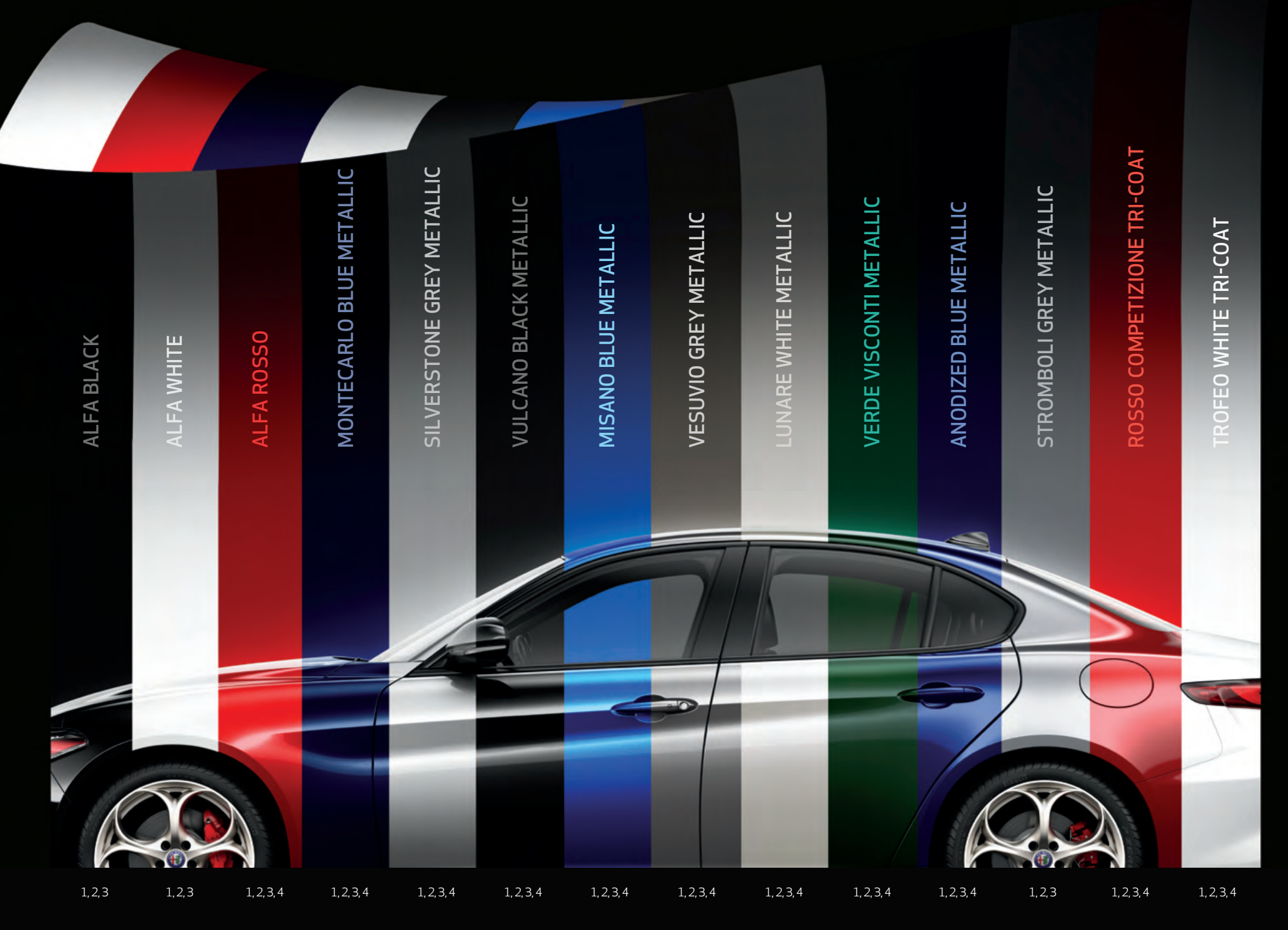
1. Sprint 2. Ti 3. Ti Sport 4. Quadrifoglio