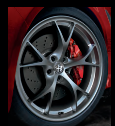
19-inch Bright Tecnico aluminum wheels Standard on Quadrifoglio