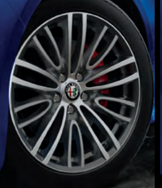
18-inch Lusso aluminum wheels Included with Ti Lusso Package