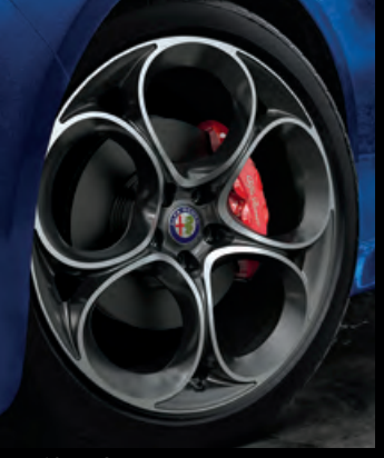
19-inch Sport 5-hole aluminum wheels Available on Ti Sport Included with Carbon Package