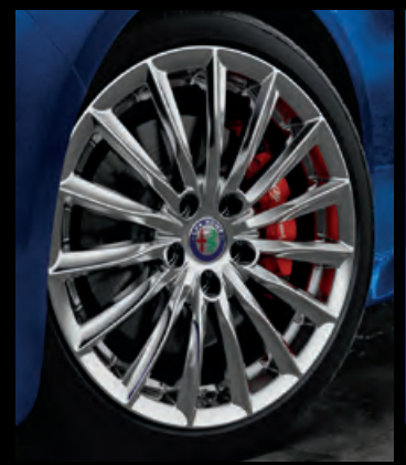
17-inch Bright 15-spoke aluminum wheels Standard on Sprint