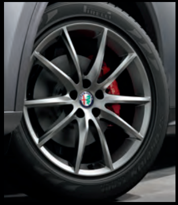
19-inch Bright 10-spoke aluminum wheels Included with Ti Lusso Package