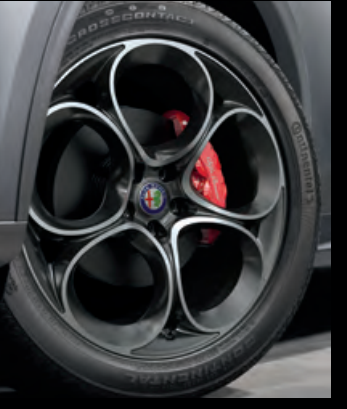
20-inch Sport 5-hole aluminum wheels Standard on Ti Sport and with Carbon Package