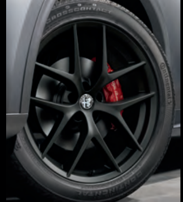
20-inch Miron Black Sport aluminum wheels Included with Nero Edizione Package