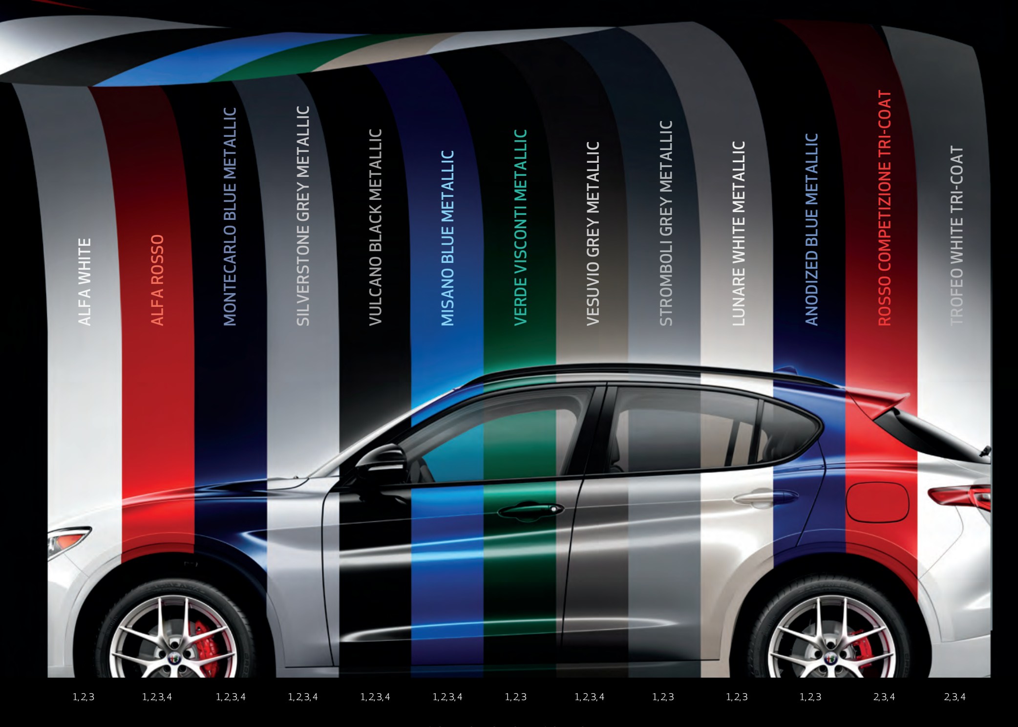
1. Sprint 2. Ti 3. Ti Sport 4. Quadrifoglio