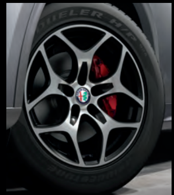
18-inch Polished Double Y-spoke aluminum wheels Available on Sprint