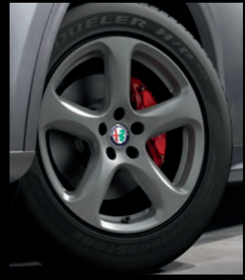
18-inch Dark 5-spoke aluminum wheels Standard on Sprint