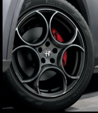
19-inch Sport 5-hole aluminum wheels Included with Nero Edizione Package on Sprint