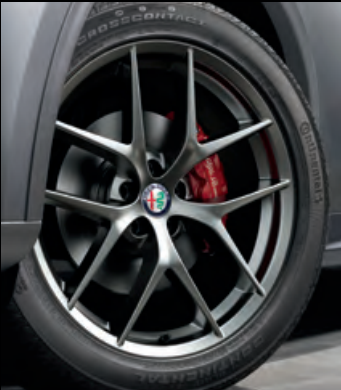
20-inch Sport aluminum wheels Available on Ti