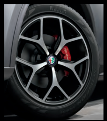
19-inch Polished Y-spoke aluminum wheels Standard on Ti