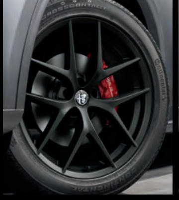
20-inch Miron Sport aluminum wheels Standard on Ti Sport with Nero Edizione Package