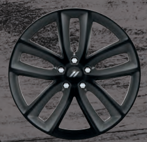
20 by 9-inch Lights Out aluminum Available on R/T with Performance Handling Package