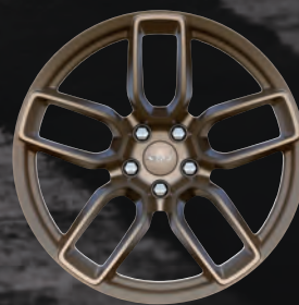
20 by 11-inch Brass Monkey (Dark Bronze) forged aluminum Available on SRT Hellcat Widebody and SRT Hellcat Redeye Widebody