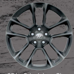
20 by 9-inch Low-Gloss Granite Crystal aluminum Standard on Scat Pack 392: Available on R/T with T/A Package