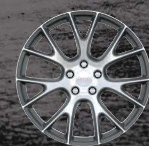
20 by 9.5-inch machined face aluminum with Granite pockets Available on SRT Hellcat and SRT Hellcat Redeye