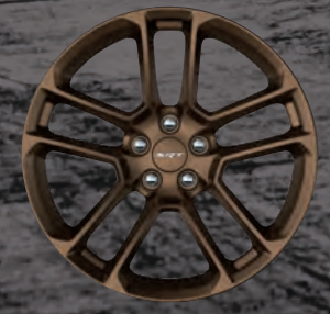
(Dark Bronze) lightweight forged aluminum and SRT Hellcat Redeye Available on Scat Pack 392, SRT Hellcat and SRT Hellcat Redeye