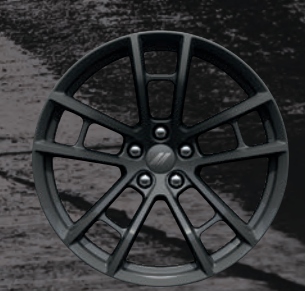
20 by 9.5-inch Low-Gloss Black aluminum Available on Scat Pack 392 with 1320 Package