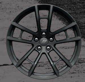
20 by 9.5-inch Low-Gloss Black forged aluminum Available on R/T with Performance Plus Package: Available on Scat Pack 392 with T/A Package and Dynamics Package