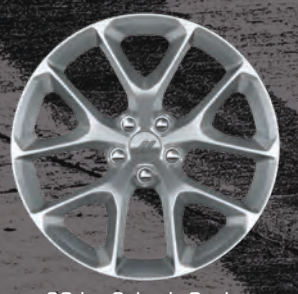
20 by 8-inch Satin Carbon aluminum Standard on GT RWD: Available on