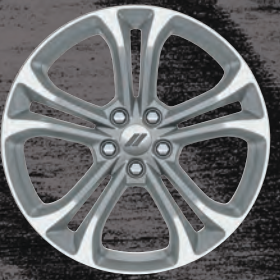
20 by 8-inch Satin Carbon aluminum Standard on R/T: Available on GT RWD with Plus Group