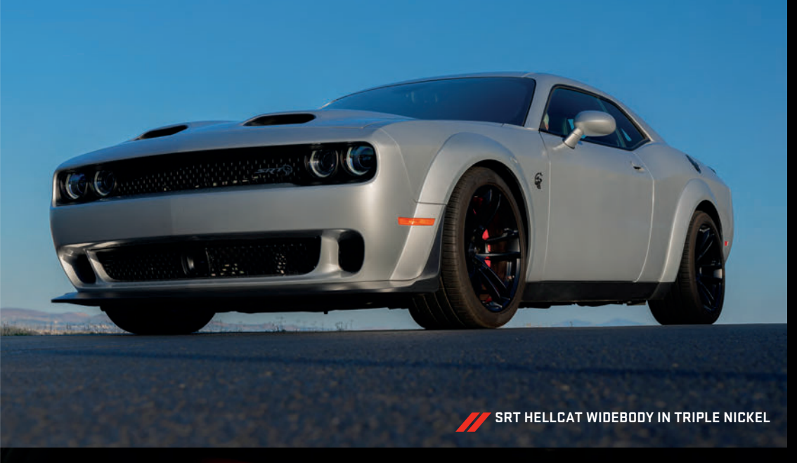
TABLE OF CONTENTS 2021 CHALLENGER

03 AWARDS 04 SRT® SUPER STOCK 05 SRT HELLCAT® REDEYE 06 SRT HELLCAT 07 SCAT PACK 392 08 1320 09 WIDEBODIES 10 INTERIOR