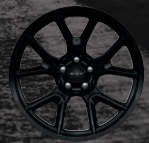
20 by 11-inch Carbon Black aluminum Standard on SRT Hellcat Redeye Widebody