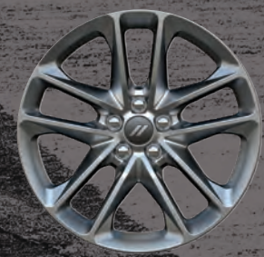
20 by 8-inch Satin Carbon aluminum Standard on GT AWD: Available on SXT RWD with Plus Group SXT AWD with Plus Group