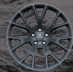
20 by 11-inch Warp-Speed Granite aluminum Available on SRT Hellcat Widebody and SRT Hellcat Redeye Widebody