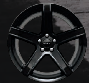
20 by 9.5-inch Low-Gloss Black 5-Deep lightweight forged aluminum Standard on SRT Hellcat and SRT Hellcat Redeye