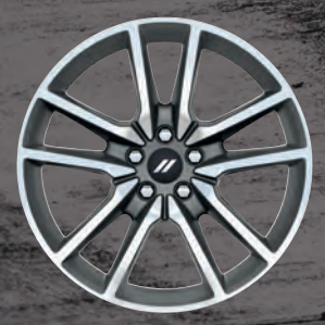
20 by 8-inch polished aluminum with Granite pockets Available on R/T with Plus Group