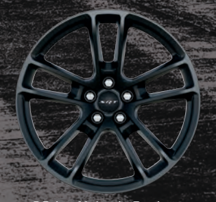
20 by 11-inch Carbon Black aluminum Standard on SRT Hellcat® Widebody: Available on Scat Pack 392 Widebody