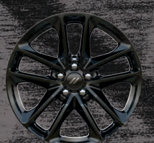
20 by 8-inch Black Noise aluminum Available on SXT AWD and GT AWD with Blacktop Package