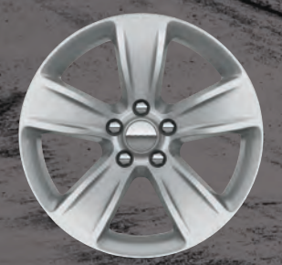
18-inch Satin Carbon Aluminum Standard on SXT RWD