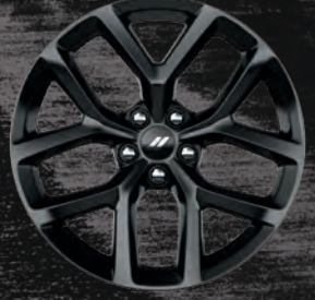
20 by 8-inch Black Noise aluminum Available on SXT RWD, GT RWD and R/T with Blacktop Package