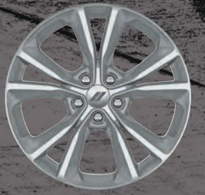
19 by 7.5-inch Satin Carbon aluminum Standard on SXT AWD