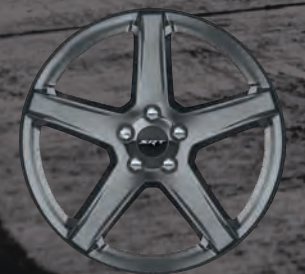
20 by 9.5-inch Matte Vapour 20 by 9.5-inch Brass Monkey SRT® aluminum Available on SRT Hellcat