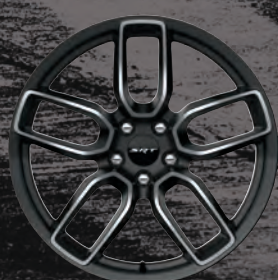
20 by 11-inch Devil's Rim aluminum Standard on Scat Pack 392 Widebody