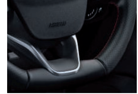
Steering wheel with perforations and red stitching. (Standard)