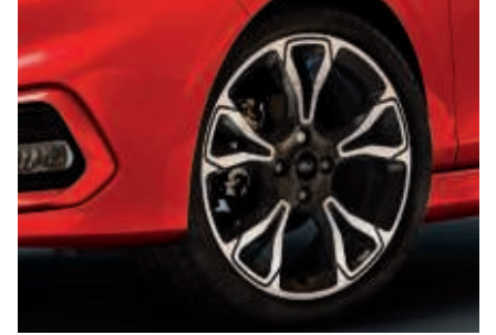
18" Rock Metallic machined alloy wheels. (Option)

1.0L Ford EcoBoost 125 PS (92 kW) 1.0L Ford EcoBoost Hybrid 125 PS (92 kW)