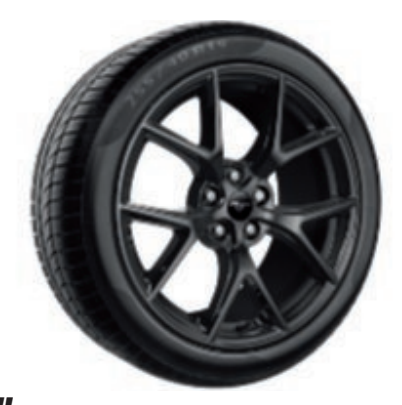
19" 19" x 9.5" front/19" x 10" rear 10 Y-spoke design alloy wheels with high gloss Magnetic painted finish

Fitted with 255/40 front and 275/40 rear tyres. (Standard on Mach 1)