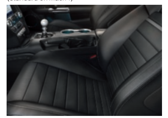
Seat insert: Register Enhanced Mini Perf over Luxury Grain Leather in Ebony with Light Dove Gray accent stripe Bolster: Lux Grain Vinyl in Ebony with Metal Grey contrast stitching