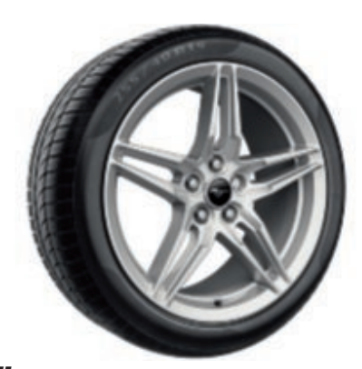
19" 19" x 9" front/19" x 9.5" rear 5x2-spoke design Luster Nickel painted forged aluminium wheels

Fitted with 255/40 front and 275/40 rear tyres. (Standard on GT)