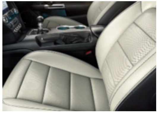
Seat insert: Mini Perf over Salerno Leather in Ceramic Bolster: Salerno Leather in Ceramic