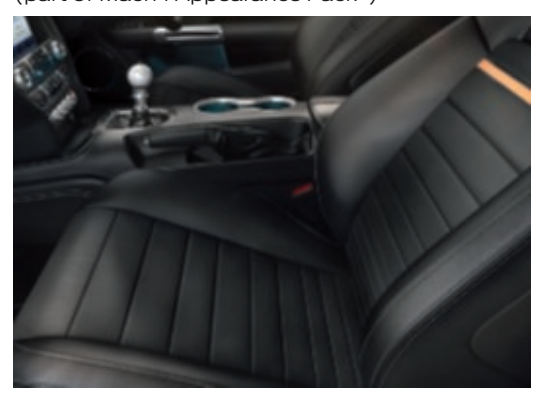
Seat insert: Register Enhanced Mini Perf over Luxury Grain Leather in Ebony with Orange accent stripe Bolster: Lux Grain Vinyl in Ebony with Metal Grey contrast