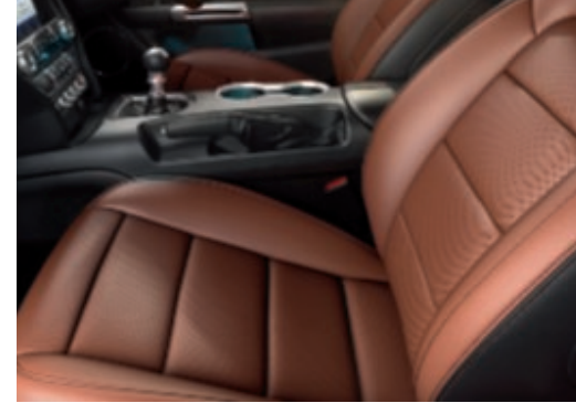
Seat insert: Mini Perf over Salerno Leather in Tan Bolster: Salerno Leather in Tan