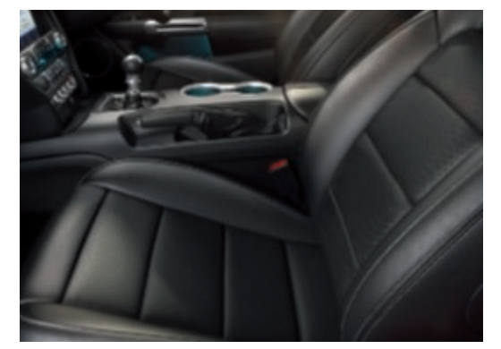
Seat insert: Mini Perf over Salerno Leather in Ebony Bolster: Salerno Leather in Ebony