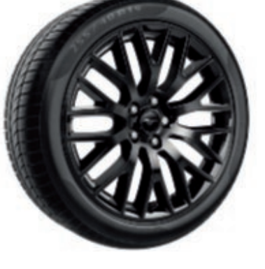
19" 19" x 9" front/19" x 9.5" rear 10 Y-spoke design alloy wheels with gloss black painted finish

Note All alloy wheels are available as accessories through your Ford Dealer at extra cost. Visit ford-accessories.com