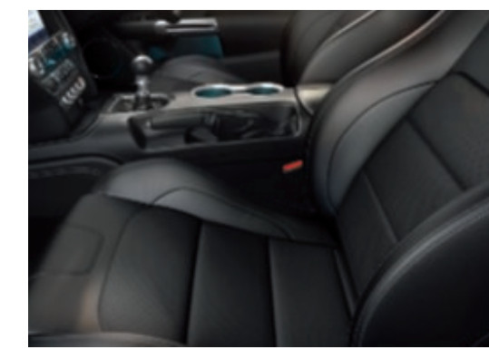
Seat insert: Salerno in Ebony/Mini Perf over Salerno in Ebony

Bolster: Mini Perf over Salerno in Ebony/Salerno in Ebony