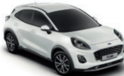
Frozen White Solid

Ford Puma owes its beautiful and durable exterior to a special multi-stage painting process. From the wax-injected steel body sections to the protective top coat, new materials and application processes ensure your new Puma will retain its good looks for many years to come.