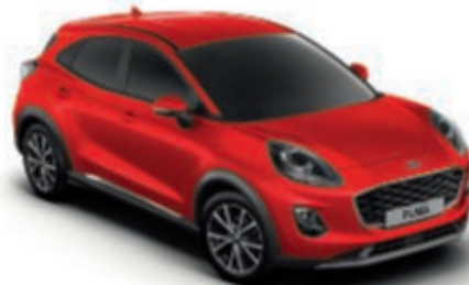
Fantastic Red Metallic*