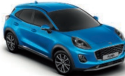
Desert Island Blue Metallic*