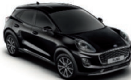
Agate Black Metallic*