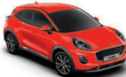
Race Red Solid