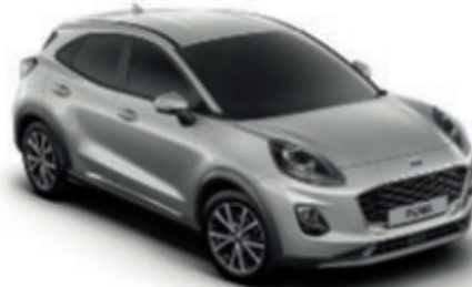
Grey Matter Solid