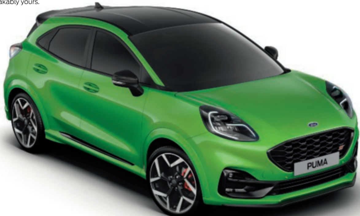
Mean Green Metallic

Choose your colour, wheels, options and extras, and make Puma unmistakably yours.