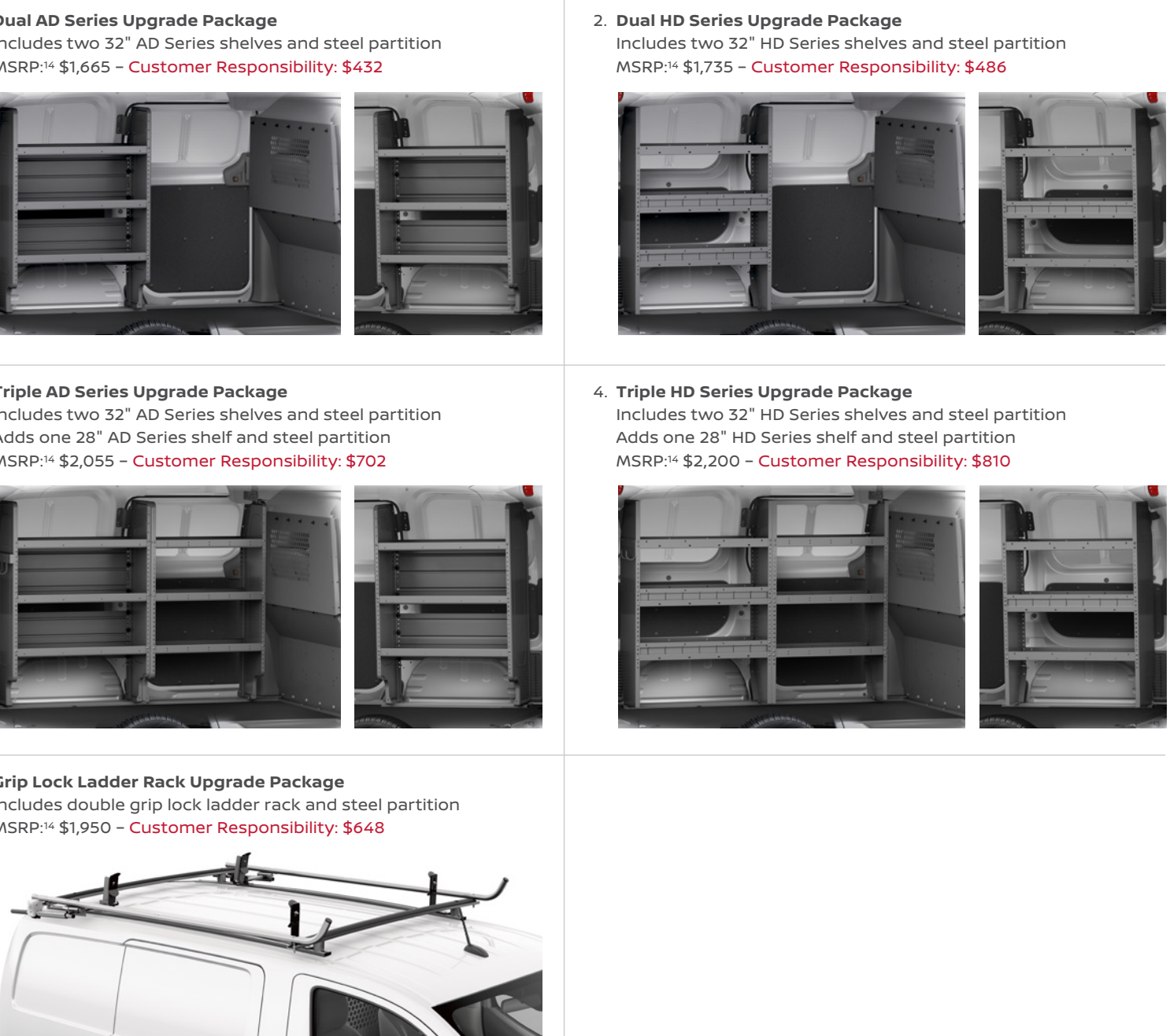
MSRP:14 $1,665 - Customer Responsibility: $432

Includes two 32" AD Series shelves and steel partition Adds one 28" AD Series shelf and steel partition MSRP:14 $2,055 - Customer Responsibility: $702