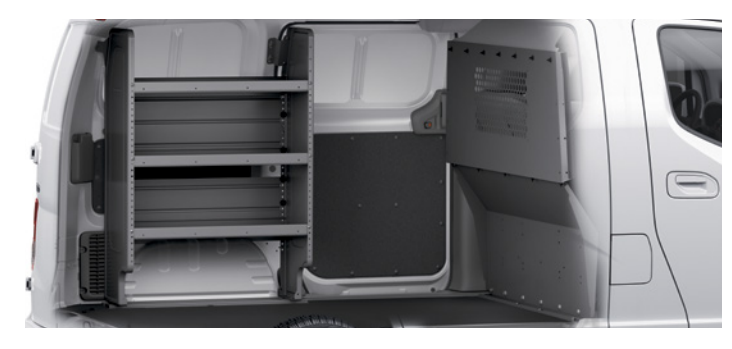
3. Base HD Series Package Includes one HD Series shelf and steel partition MSRP:14 $1,150 - Customer Responsibility: $0

Includes one AD Series shelf and steel partition MSRP:14 $1,090 - Customer Responsibility: $0