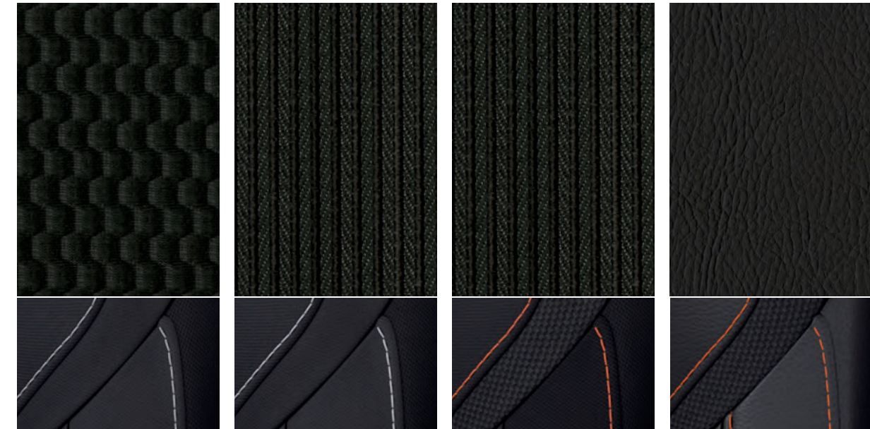
Charcoal Cloth S