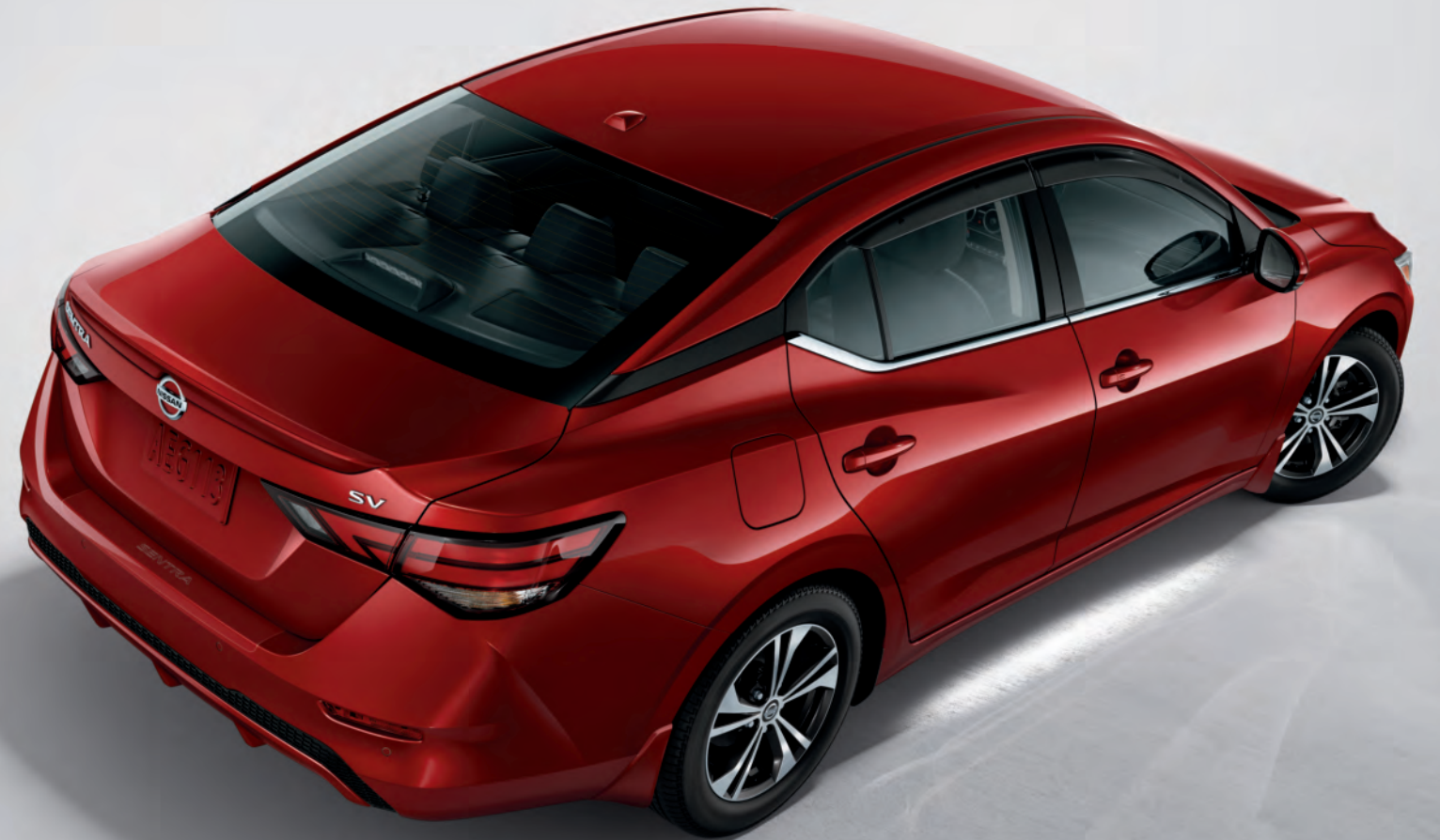
Nissan Sentra® SV shown in Scarlet Ember with Rear Decklid Spoiler, Side-Window Deflectors, Splash Guards, Clear Rear Bumper Protector, and Exterior Ground Lighting. Images shown are for illustration purposes only.

Every Genuine Nissan Accessory is custom-fit, custom-designed and durability-tested. Each one is backed by Nissan's 3-year/60,000-km (whichever occurs first) limited warranty (if installed by dealer at the time of purchase), and can be financed when installed by dealer at time of purchase. Terms, conditions, and exclusions apply. See your Warranty Information Booklet for complete details.