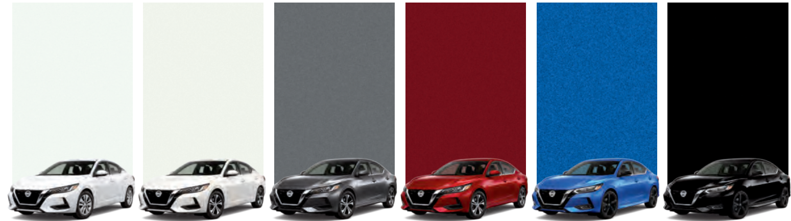
Fresh Powder QM1