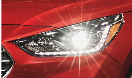
LED headlights and Daytime Running Lights