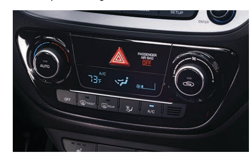
Automatic temperature control