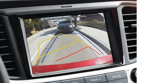
Rearview camera with dynamic guidelines