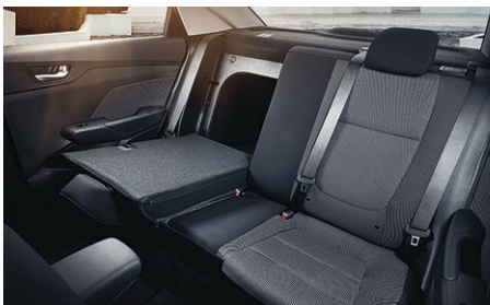
60/40 split-folding rear seats