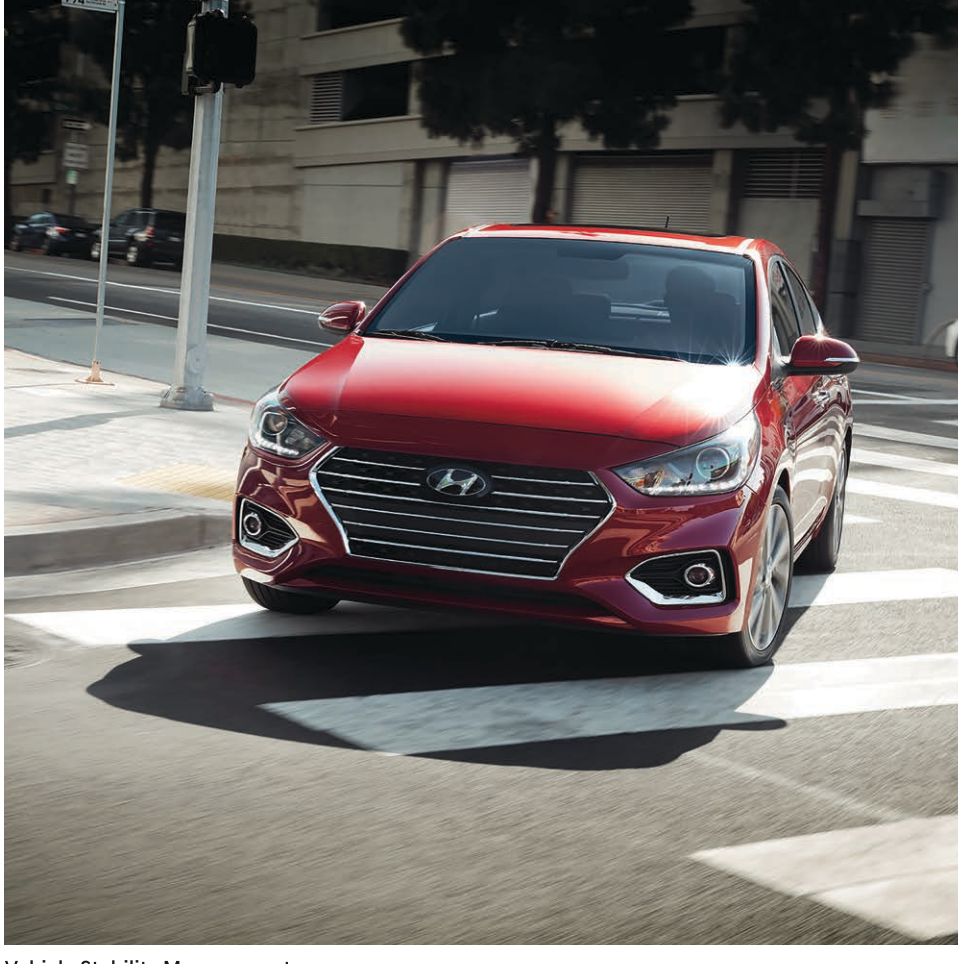
Vehicle Stability Management

<sup>1</sup> Forward Collision-Avoidance Assist (FCA) is designed to assist drivers to help avoid, or reduce the severity of, collisions with cars that have slowed or stopped in front of them. It is a supplemental assist and does not replace the need for extreme care and attention by the driver. FCA may not stop the vehicle completely and will not avoid all collisions. See Owner's Manual for details and limitations. <sup>2</sup> Claim based on comparison of specifications on manufacturer websites at the time of printing. 3 EPA estimate with automatic transmission for comparison only. Your actual mileage will vary with options, driving conditions, driving habits and the vehicle's condition. 4 Standard and available safety features vary by model and trim level. Refer to the Features section in the back of this brochure or visit HyundaiUSA.com for details.