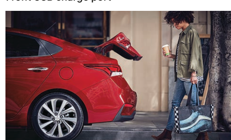
Hands-free smart trunk release