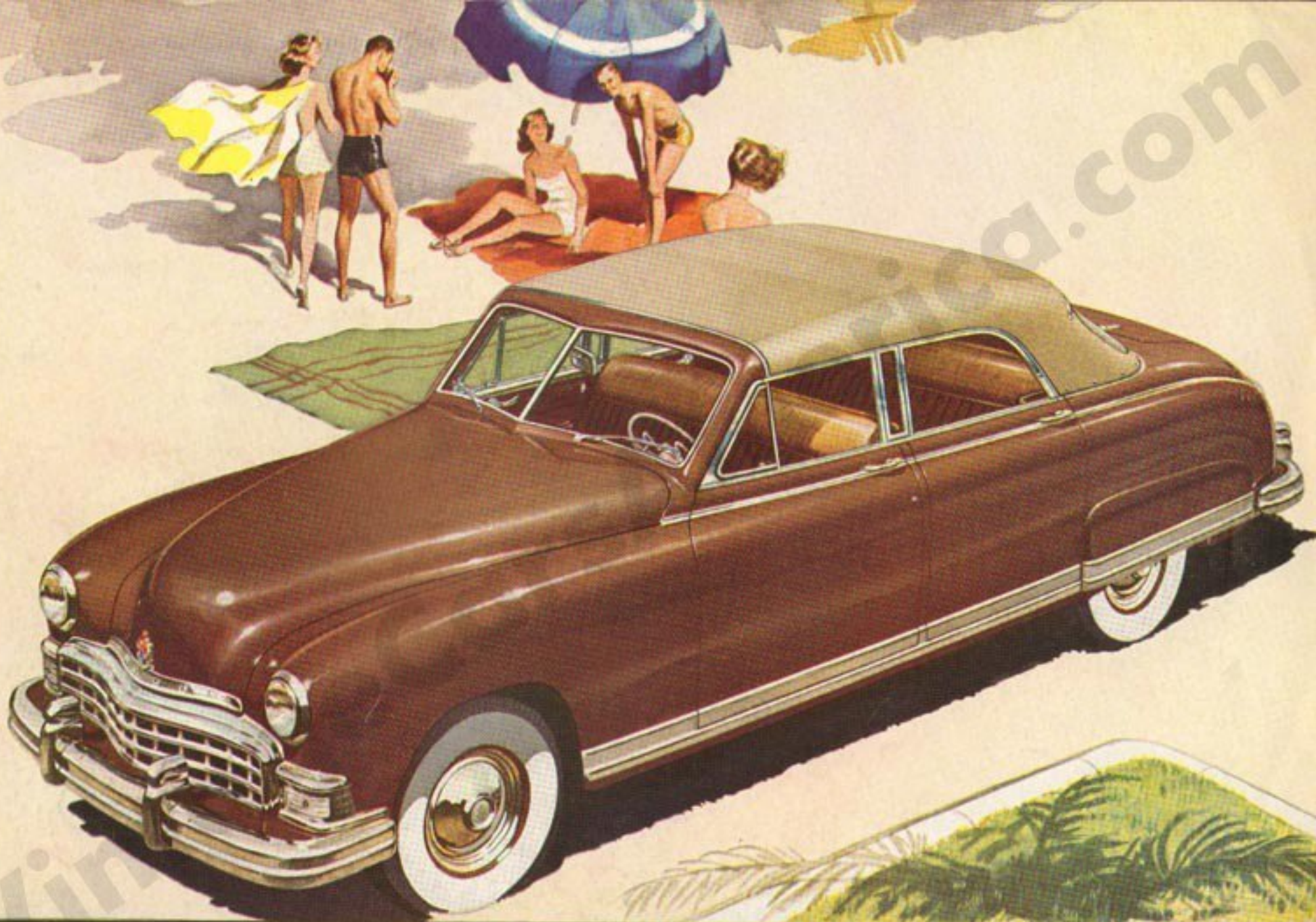
THE 1949 FRAZER 4-DOOR CONVERTIBLE