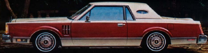
The Givenchy Designer Series Continental Mark VI.

Hubert Givenchy, the renowned French designer, creates true high-fashion glamour, expressed with new strength and authority.