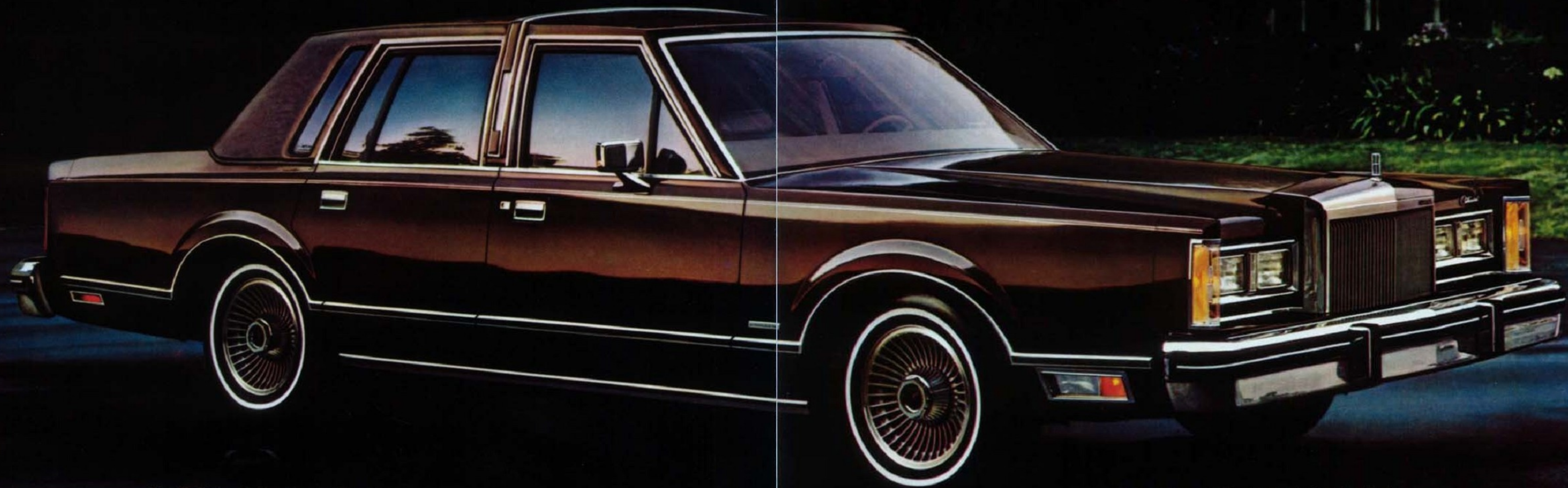
The 1980 Lincoln Continental Town Car

Introducing 1980 Lincoln Continental. Uncompromised elegance with remarkably improved fuel efficiency ratings.