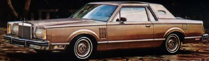
The Pucci Designer Series Continental Mark VI.

Italy's Emilio Pucci takes the leisure look to its ultimate possibilities with his cool, casual tone-on-tone design.