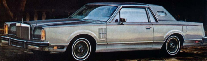
The Cartier Designer Series Continental Mark VI.