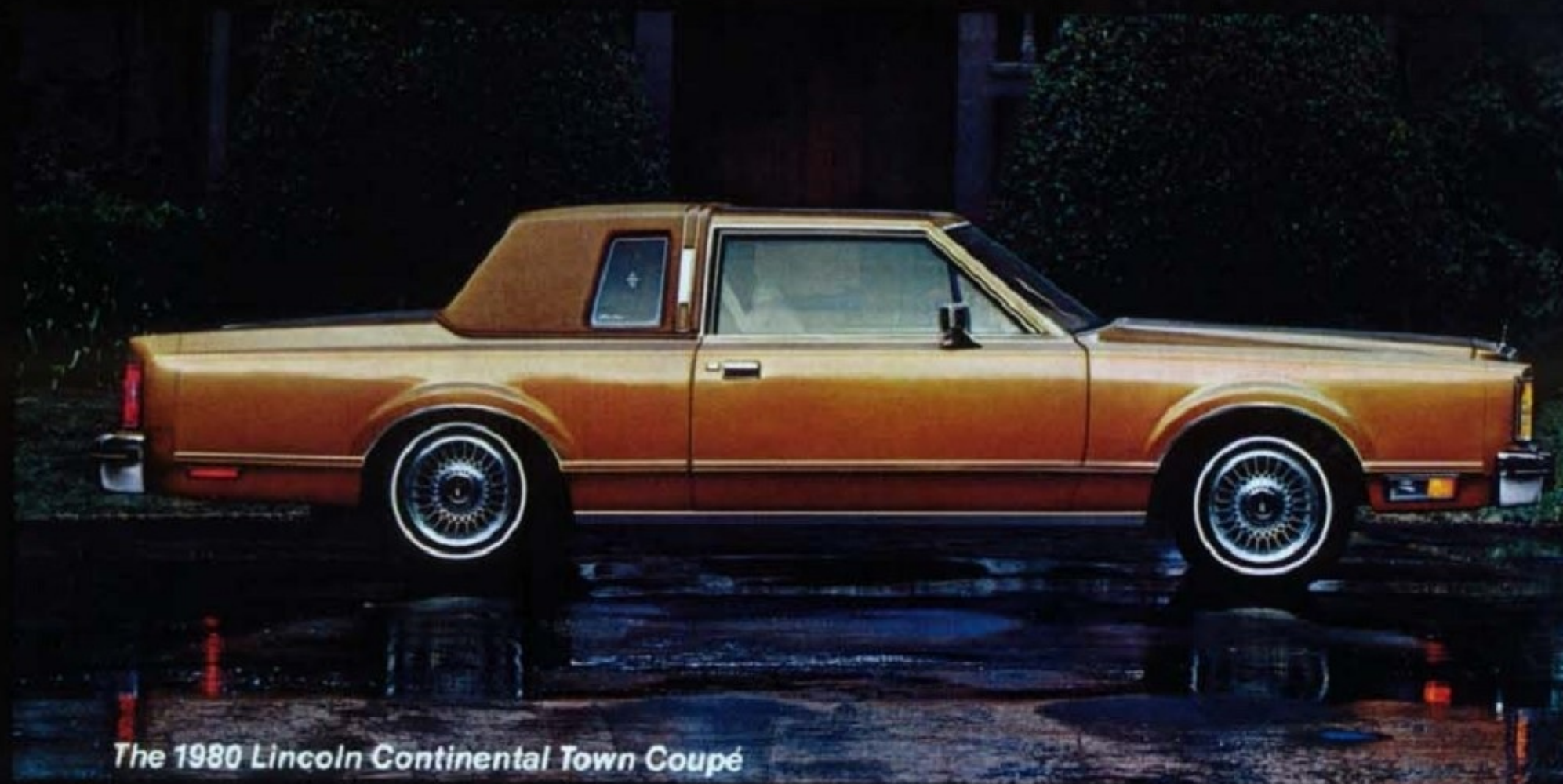
The 1980 Lincoln Continental Town Coupé

One look reveals that the new Lincoln Continental has retained its impressiveness. And one drive will reassure you that the luxuries of comfort and ride continue to live within this remarkable automobile.