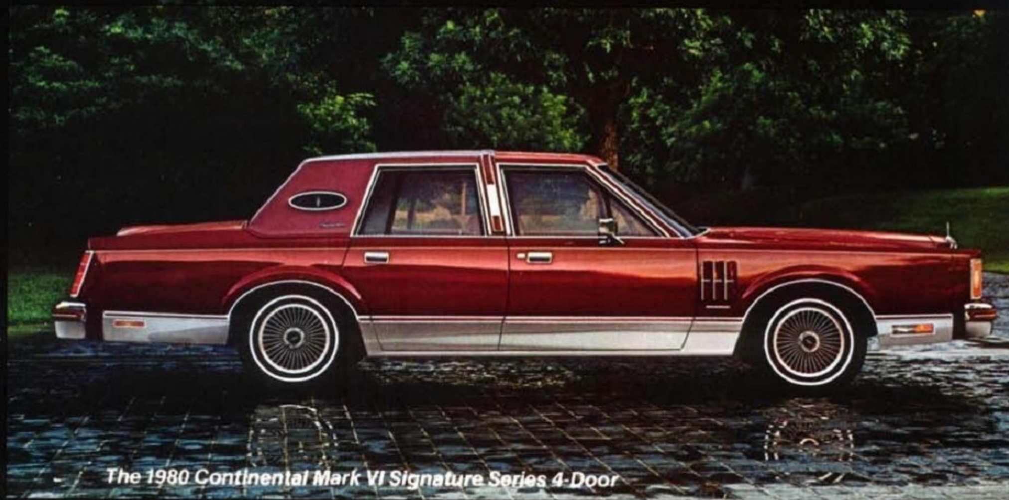
The 1980 Continental Mark VI Signature Series 4-Door

Throughout the history of the Continental Mark, its originality of design has prevailed. That is still true for the 1980s. Yet so much is new. There is a remarkable new electronic instrument panel with a message center that literally communicates with you. And Mark offers electronic engine controls that manage five separate engine functions.