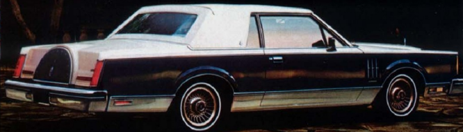
The Bill Blass Designer Series Continental Mark VI.

The statement of America's Bill Blass is fluid, sporty and topped with a Carriage Roof that recalls the classic convertible.