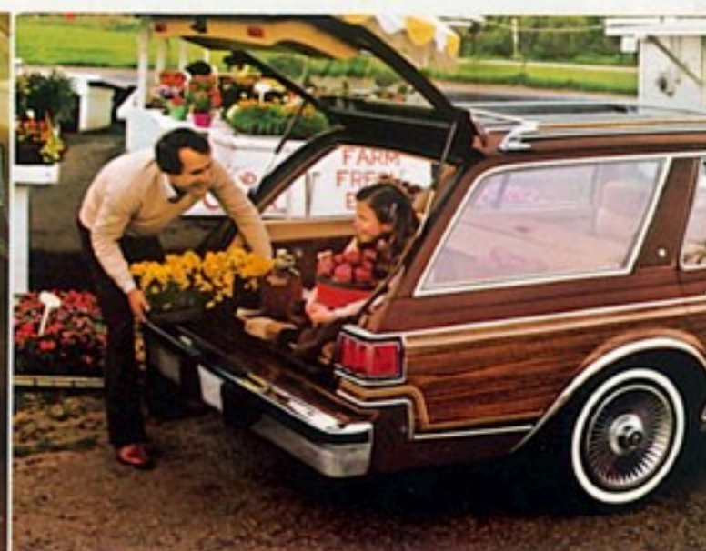
LeBARON'S LIFTGATE OPENS WIDE TO PROVIDE A BIG ENTRYWAY TO ITS 2m 3 CARGO AREA.