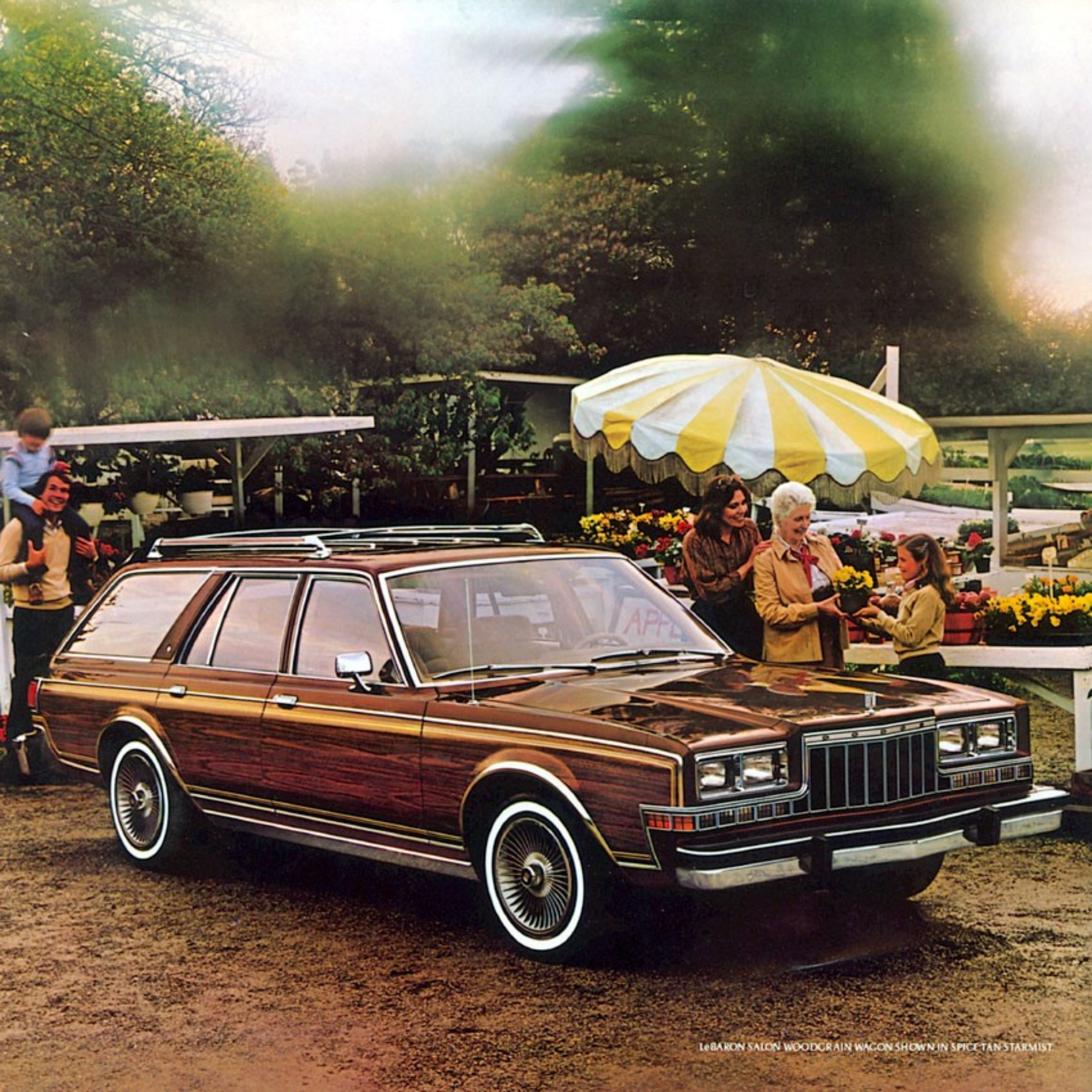
LeBARON SALON WOODGRAIN WAGON SHOWN IN SPICE-TAN STARMIST.