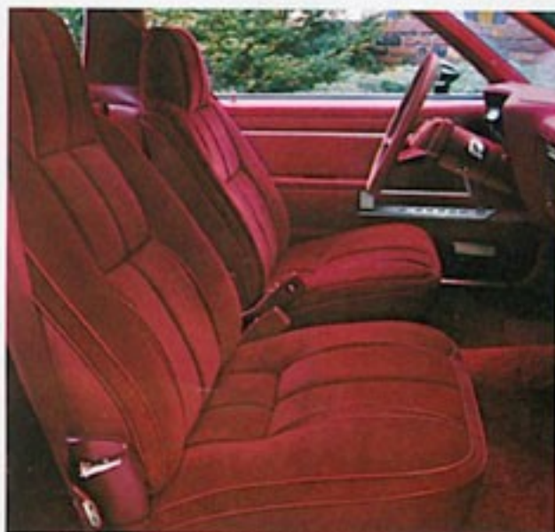
LeBARON SALON'S OPTIONAL HIGH-BACK BUCKET SEAT INTERIOR, SHOWN HERE IN RED CLOTH.

You'll notice the smooth-shifting TorqueFlite wide-ratio automatic transmission and how well it works with the standard power steering, power brakes and radial tires to make LeBaron perform and handle like the quality mid-size car that it is.