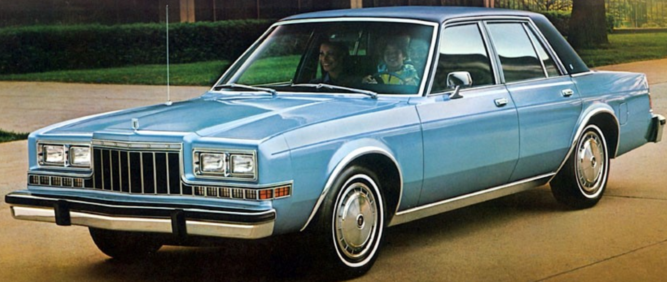
LeBARON MEDALLION FOUR-DOOR SEDAN SHOWN IN DAYSTAR BLUE.