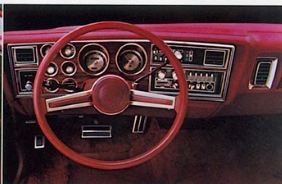
LeBARON SPORT COUPE'S STANDARD INSTRUMENT PANEL WITH STANDARD TWO-SPOKE STEERING WHEEL, SHOWN WITH OPTIONAL AM/FM STEREO RADIO WITH CB AND AIR CONDITIONING.