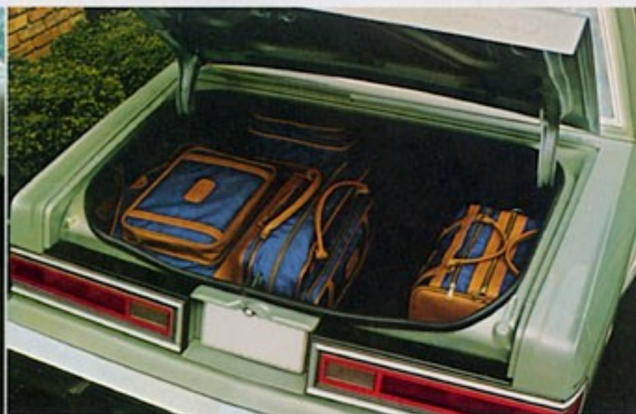
LeBARON'S TRUNK OFFERS .44m 3 OF CARGO SPACE.