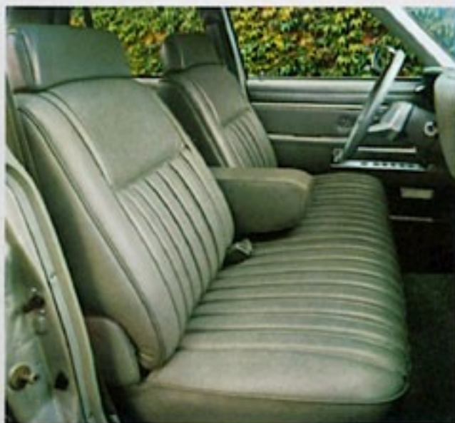
OPTIONAL VINYL BENCH SEAT WITH FOLDING CENTER ARMREST. OFFERED IN GREEN, RED, CASHMERE.

It all adds up to an admirable combination of engineering and assembly that reflects the quality inherent in LeBaron's basic design. Sensible? Very much so. But then Chrysler...and you...wouldn't have it any other way.