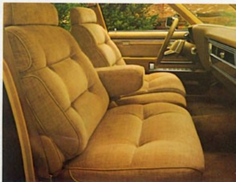
LeBARON SALON WAGON OPTIONAL CLOTH-AND-VINYL 60/40 SEAT WITH FOLDING ARMREST. SHOWN IN CASHMERE.

You expect a wagon to be a worker. And work this wagon does. It was built for it. Under the watchful eye of Chrysler's tough quality control program. LeBaron Wagons - all LeBarons, for that matter - are selected at random as they come off the assembly line or as they wait to be shipped. They're checked for fit, function and appearance ...before they are delivered to dealers or customers. If they don't make the grade, they're sent back. It's as simple as that. That's the only way to ensure a well-built, quality car. And that's the way Chrysler builds its LeBarons. Every one is shown the special attention it deserves.