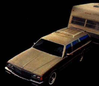
Caprice and Impala can be powerful towing vehicles.

*Availability of optional equipment varies with model and equipment ordered. Ask your dealer for details.