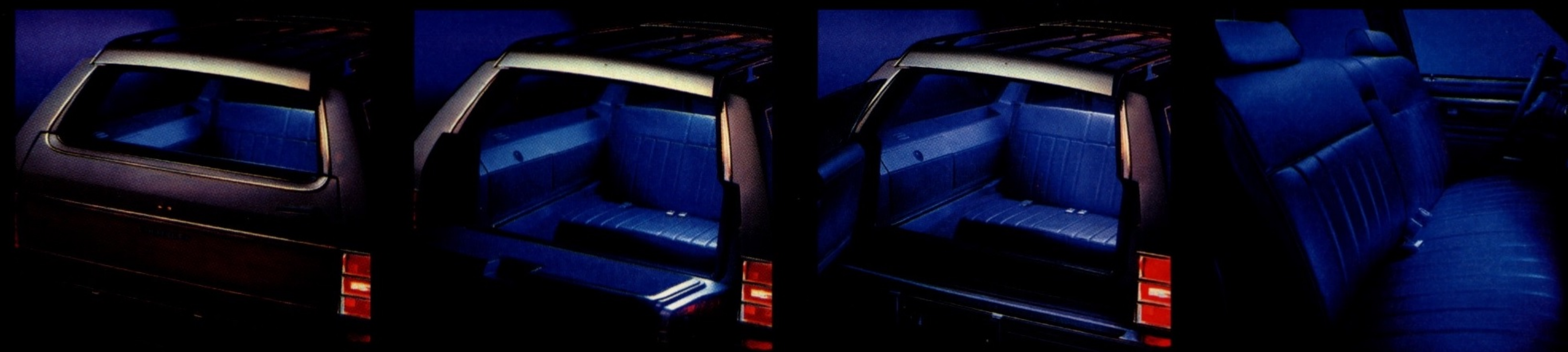
Caprice Classic Wagon's three-way tailgate with power window permits easy loading of packages, people or cargo. The standard vinyl seat, shown far right, features a pull-down centre armrest.