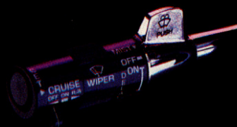
Available electronic Speed Control with resume and speed adjustment features.

Some Chevrolets are equipped with engines produced by other GM divisions, subsidiaries, or affiliated companies worldwide. See your dealer for details.