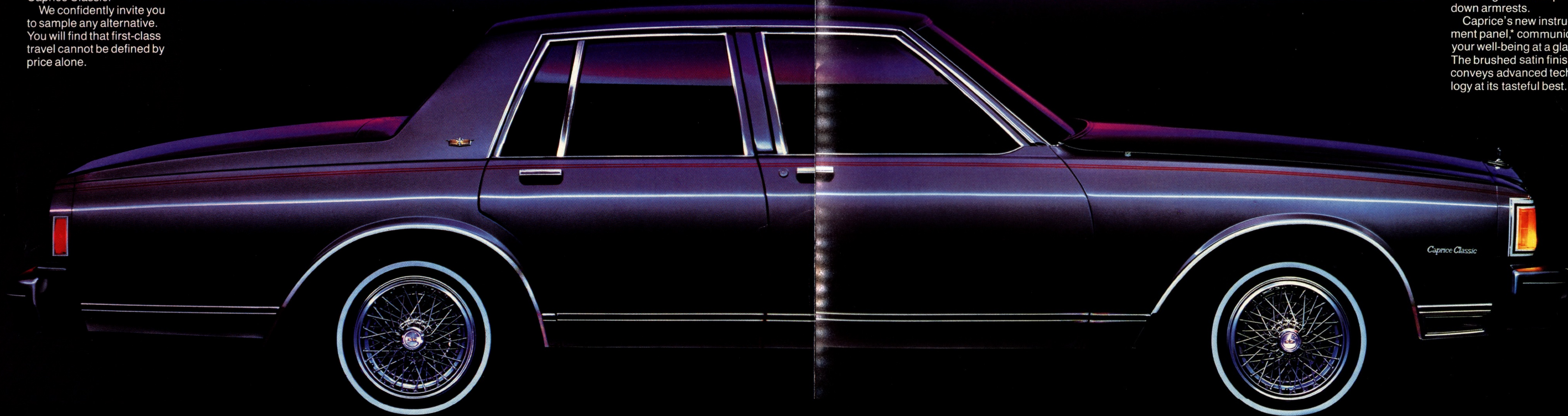
Caprice Classic Sedan shown above and on front cover.