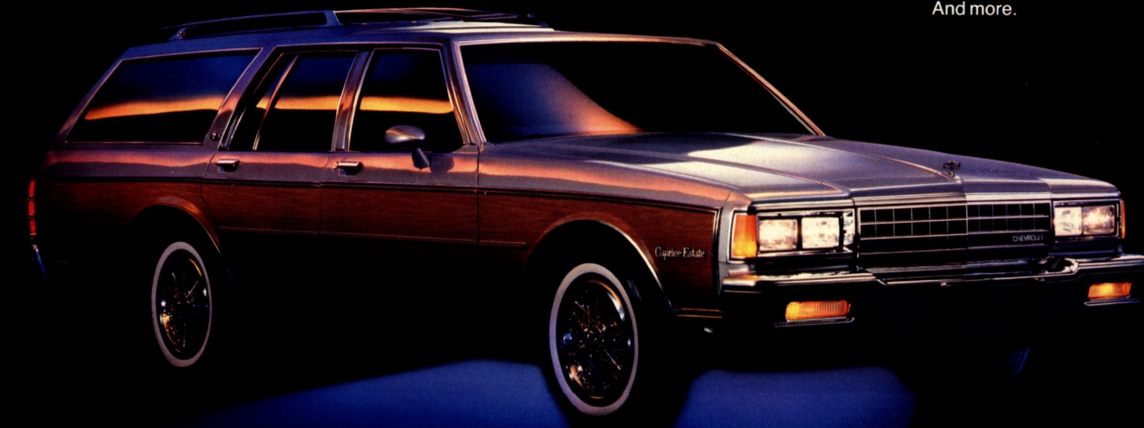
Caprice Classic Station Wagon with available Estate package.