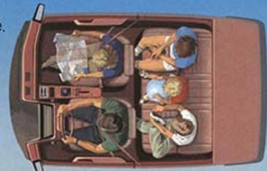
An innovative interior layout provides room for five.

And the Mirage simultaneously soothes the conscience, while it satisfies the soul. Its ample power comes from an overhead cam MCA-Jet™ powerplant. With an advanced