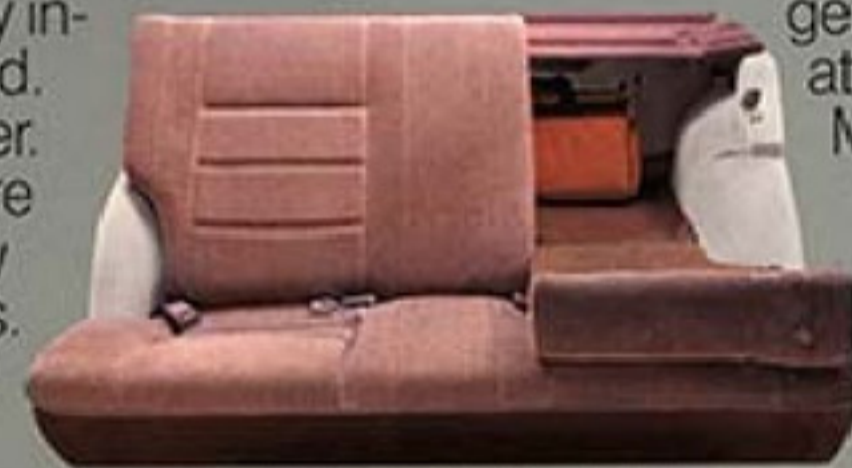
Split fold-down rear seats provide access to your stowed gear. Standard on LS.

A rear window defogger is standard on the L, LS and Turbo models. LS and Turbo owners can let the sun shine in with an optional electric sliding glass sunroof. There's also an optional wiper/washer for the