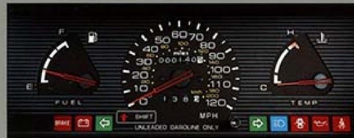
Instrumentation is designed for fast reads.

But, if you still haven't found your dream come true, open these two pages and get a load of another eye opener.