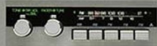
Fine stereo equipment is an entertaining option on all models.

And riding in the Mirage is a quiet pleasure. Because a vast array of vibration-dampening and sound-absorbing materials are designed to insure lots of peaceful comfort.