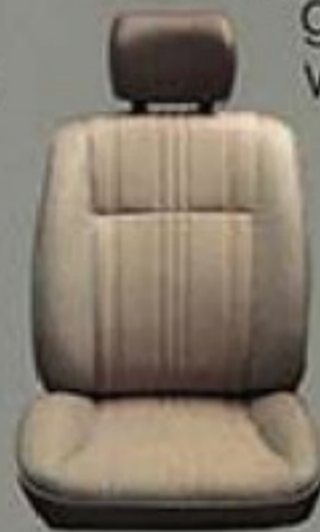
Seats pamper, yet provide firm support.

More style with a color-keyed front grille and rich, handsome wheel treatment.