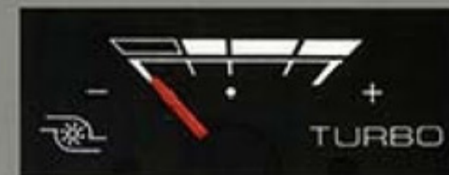
A boost gauge keeps you up to speed on your turbo.

Because the new Mitsubishi Mirage Turbo Three-Door stands as dramatic, conclusive proof that get up and go hasn't got up and gone from the sub-compact car category.