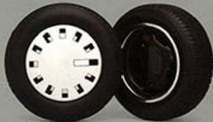
Steel-belted radial tires hug the road while stylish wheel treatment pleases the eye.

Inside, every new Mirage provides plenty of