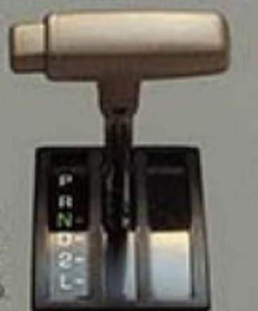
Get an optional ELC™ automatic transmission on Mirage L or Turbo.