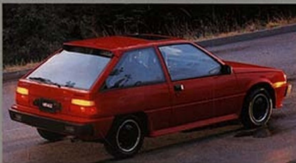
The Mirage Turbo looks and handles like a dream.

Graceful and aerodynamic. Both of the bumpers are integrated. The nose is sloped and flows into a flush-mounted windshield.