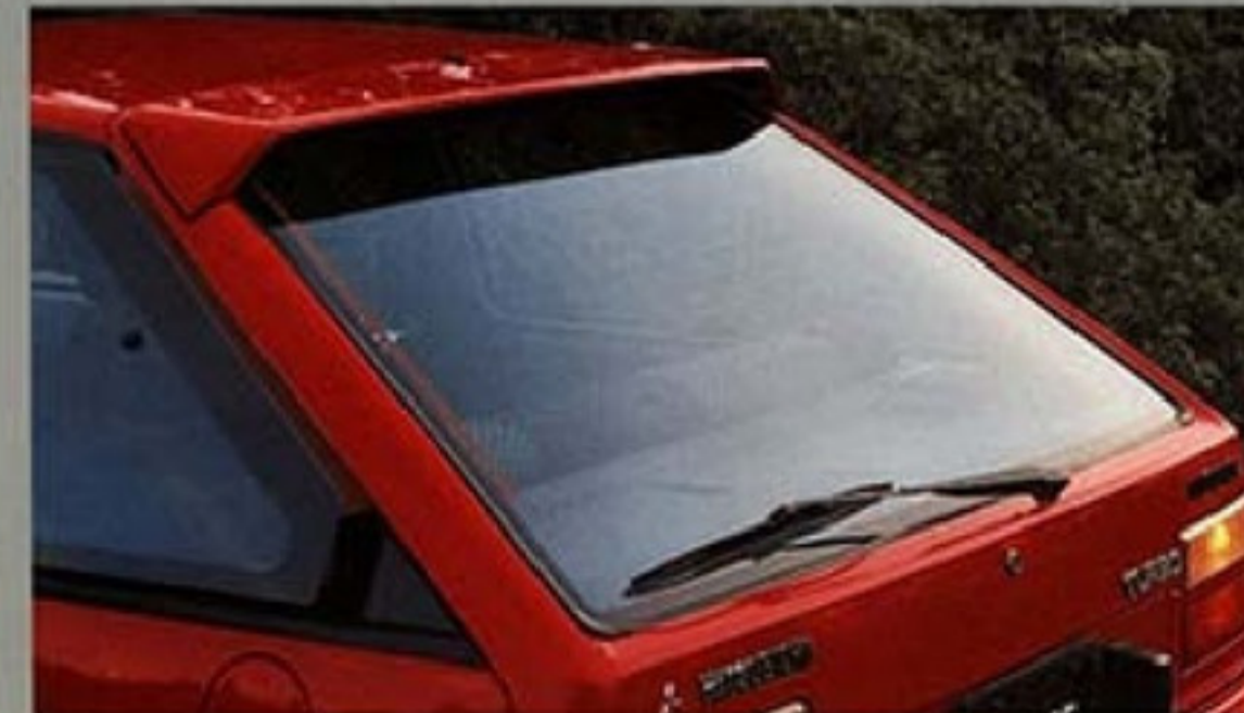
An optional rear window wiper/washer is designed to help you see your way clear through bad weather in the LS and Turbo models.

Move up to the new Mirage L, and surround yourself with even more luxury. Like cloth-insert seats, passenger assist grips and plush carpeting. Lower door panels are carpeted. Map pockets help organize. And a passenger walk-in system facilitates entry into the rear seat. It's all standard.