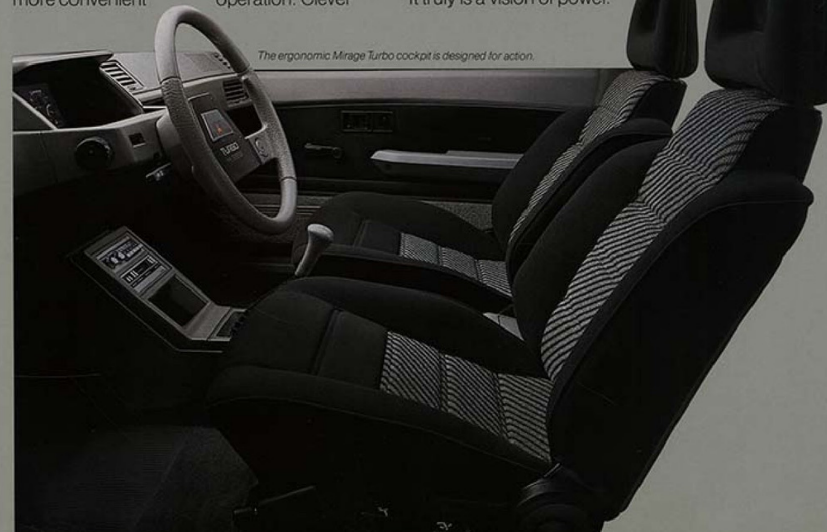
The ergonomic Mirage Turbo cockpit is designed for action.