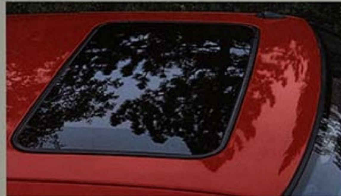
An optional electric glass sunroof slides open on the LS and Turbo models.

comfort with a center console. Full carpeting. And full door trim. Wing-mounted switches provide a more natural driving environment.