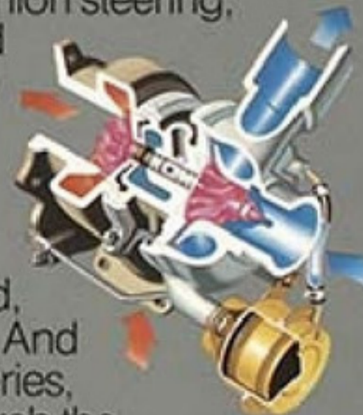
The ingenious Mitsubishi Turbocharging System is watercooled.

The suspension is turbo-tuned with higher-rate springs, rack-and-pinion steering, firmer shock valving, and a rear stabilizer bar. Fully independent front and rear suspension allows Mirage Turbo to nimbly respond to your input. There are power-assisted, vented front disc brakes. And high-performance 60-series, asymmetric radial tires grab the road with authority. The result is