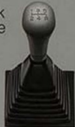
A five-speed manual overdrive transfers all that turbo power with precision.

simply phenomenal handling that gives you quick response.