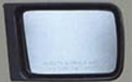
A right-hand side mirror is standard on Mirage LS and Mirage Turbo.

To guard against rust, extensive anti-corrosion measures have been taken. After wax-injection and special sealing, the entire structure is dipped in primer. And, it's all backed up by a 5-year/50,000-mile limited warranty against body rust-through.* All to keep your new Mirage looking great.