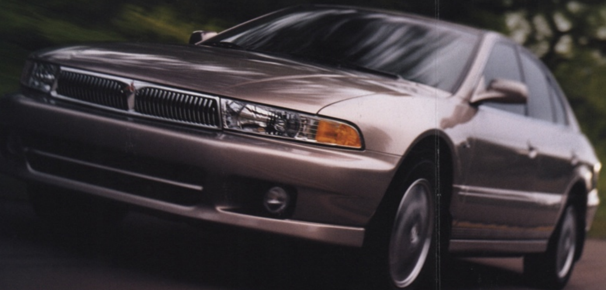
Model: Galant LS with optional mudguards

If you're the shy type, consider this a warning.