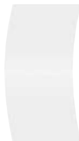
Arctic White 16