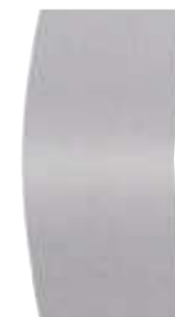
Ultra Silver Metallic 95