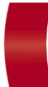
Bright Red 81