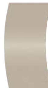
Light Taupe Metallic (SE only) 49