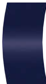
Indigo Blue 39