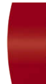
Red-Orange Metallic (SE only) 96