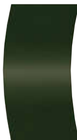
Spruce Green Metallic 35