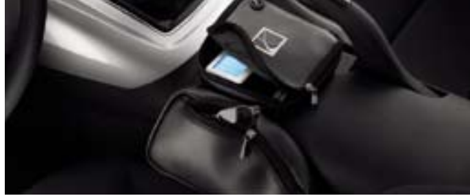
Trunk storage bag Console saddle bag