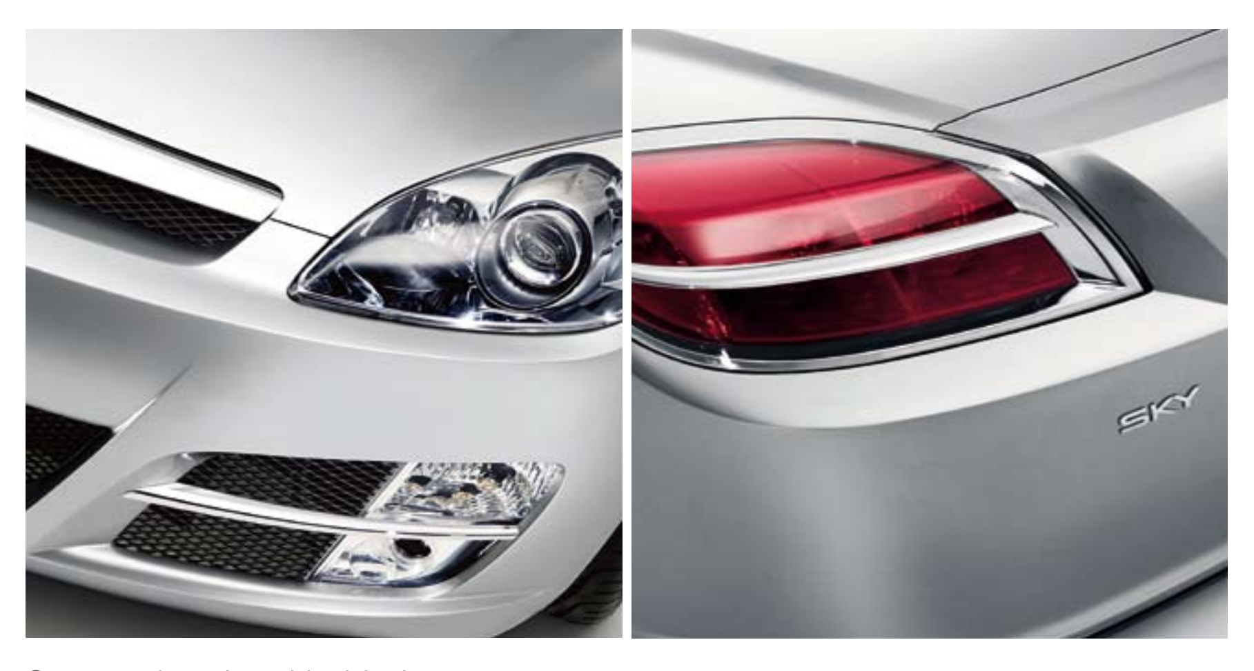
Curves ahead and behind. Hydroforming – shaping with water – is how we sculpted the most distinctive of the SKY's generous, angular curves. It's an innovative technique chosen to ensure that the silhouette of the car built for you is as striking as the one Saturn designers first sketched. And it's seen clearly in the flowing, muscular hood line, the way the headlamps appear melded into the body, and the rear quarter panels that complete the sweeping, aerodynamic profile. Just try to keep both eyes on the road.