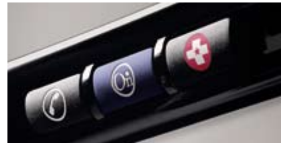
OnStar. Your SKY comes with one year of OnStar, which can provide you with Advanced Automatic Crash Notification. So even if you're involved in a collision and your air bags don't deploy, your vehicle can automatically send a signal to an OnStar Advisor who will contact you to see if you need help.