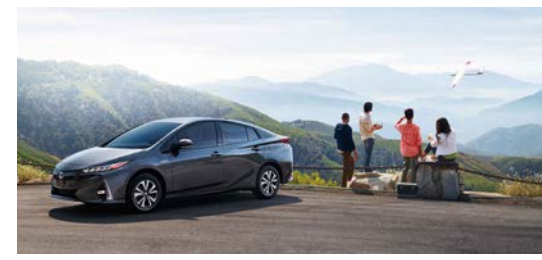
Genuine Toyota Accessories: Discover new worlds of driving pleasure.