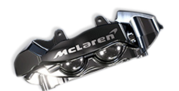
Polished with machined McLaren logo