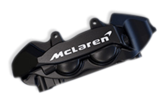
Black with printed McLaren logo