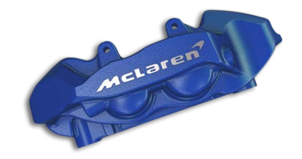
Azura Blue with silver machined McLaren Logo