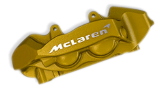
Yellow with machined McLaren logo