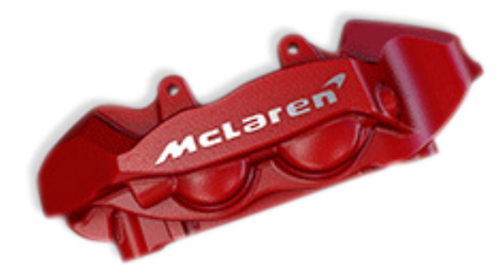
Red with machined McLaren logo