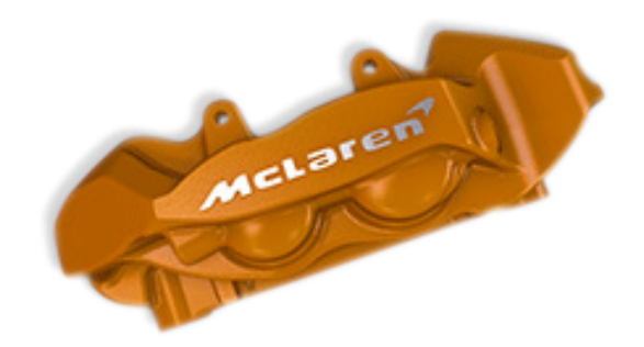
McLaren Orange with machined McLaren logo