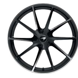
Satin Diamond cut finish