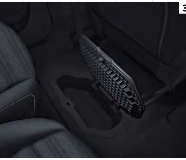
<sup>2</sup>Optional. Not available on XL or 7-seat models. <sup>3</sup>Depending on the configuration, total number of storage compartments