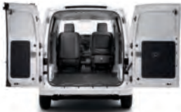
40/60 180° Opening Rear Doors