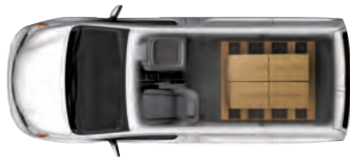
122.7 Cu. Ft. (3,474 Litres) Cargo Capacity 1