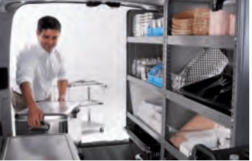
Integrated reinforced cargo-mounting points allow cargo racks, partitions and bins to be securely mounted! Integrated exterior roof rack-mounting points help secure racks!