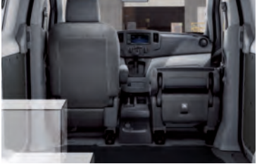
Fold-down passenger seat helps make room for longer items!

With Nissan Upfit Engineering, NV200® Compact Cargo has been designed to let you create a commercial vehicle that is small on the outside, but creates lots of room on the inside. From flat wheel wells to a fold-down passenger seat, every available inch is ready to work – it can easily carry a 40" x 48" pallet. And with integrated interior reinforced cargo-mounting points and integrated roof-mounting points, the NV200 Compact Cargo is an upfitter-friendly base to build your business on!