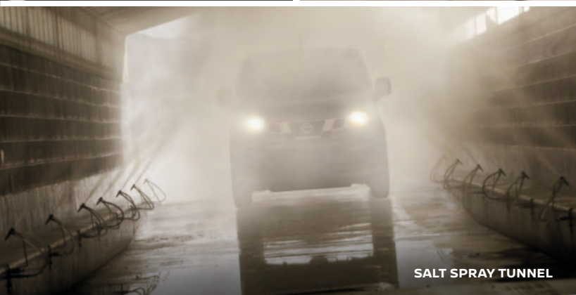
SALT SPRAY TUNNEL

The Nissan Arizona Testing Centre. Think your drive is tough? Welcome to one of the most challenging places on earth. We test day and night, in scorching heat, freezing cold, on high-speed ovals and in torturous road conditions. But the results are worth it – the most rugged commercial vans you can buy.