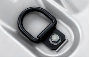
Six floor-mounted and six wall-mounted D-ring tie-downs. 1,2