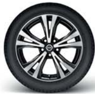
18" alloy (machine cut)