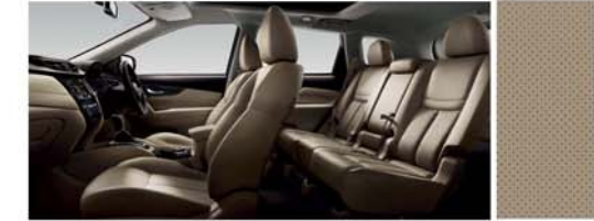
LEATHER WITH PERFORATION - CREAM