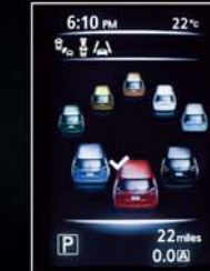
MATCH THE DISPLAY TO YOUR COLOUR