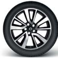
19" alloy (machine cut)