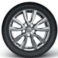
17" alloy (silver painted)