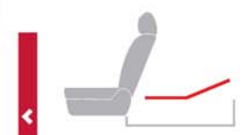
Secret spot. A long, flat floor for big items, with under-floor storage for things you want to keep out of sight, such as a laptop.