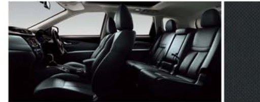
LEATHER WITH PERFORATION - GRAPHITE