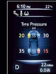
TYRE PRESSURE MONITORING SYSTEM