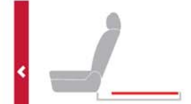
Lower your floor for added height to fit in those tall items.