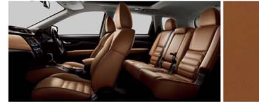
TAN LEATHER WITH BLACK LEATHER INSERTS