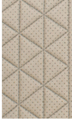
Cashmere Premium Ascot Leather<sup>6</sup> Platinum