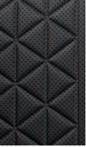
Charcoal Premium Ascot Leather<sup>6</sup> Platinum