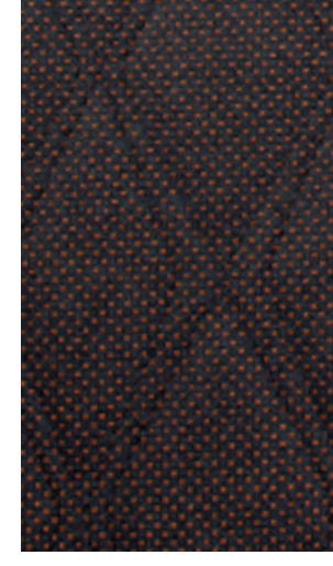
Charcoal Premium Ascot Leather with Alcantara® Inserts<sup>6</sup> SR