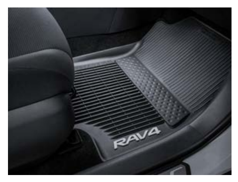
All-weather floor liners<sup>44</sup>