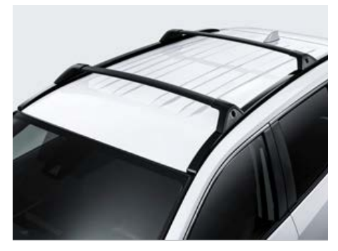
Roof rack cross bars