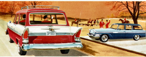
PACKARD CLIPPER COUNTRY SEDAN

personal comfort and flawless motoring enjoyment. Take the wheel today, and discover how much more there can be to motoring... in the considerably priced, craftsmanship-quality Packard Clipper for 1957.