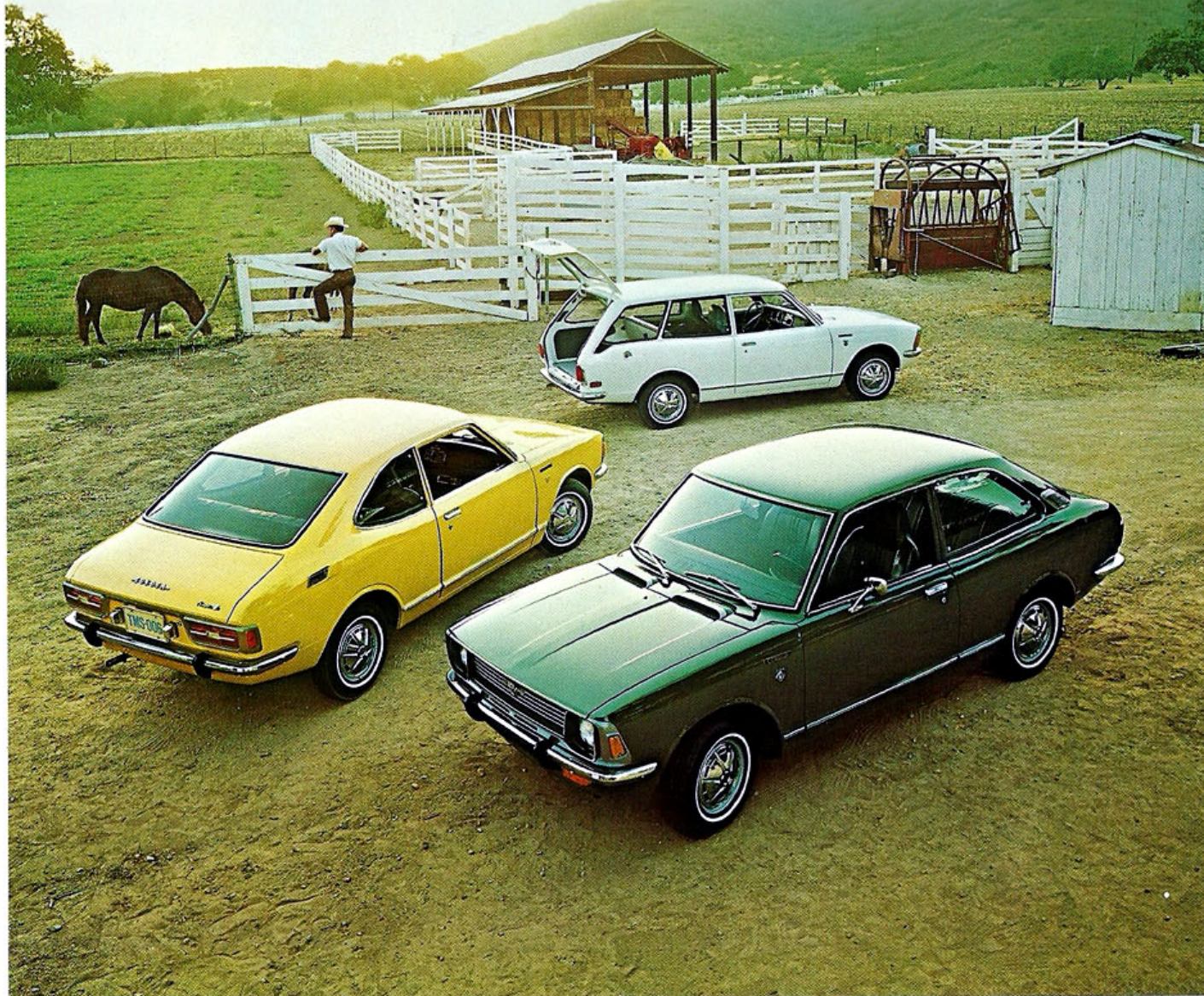
Toyota Corolla Fastback Coupe, Two-Door Wagon, Two-Door Sedan

ENGINE: 4 cyl. in line, OHV. DISPLACEMENT: 71.1 cu. in. COMPRESSION RATIO: 9.0:1. HORSEPOWER: 73 hp @ 6,000 rpm. MAX. TORQUE: 74.2 ft. lb. @ 3,800 rpm. CARBURETOR: One downdraft, 2-barrel. TRANSMISSION: 4-speed synchromesh. Automatic transmission (optional on Coupe and 2-door Sedan): 2-speed. BRAKES: Power braking system with front discs. WHEELBASE: 91.9 in. WEIGHT: Coupe: 1,715 lbs. 2-door Sedan: 1,725 lbs. Station Wagon: 1,805 lbs. PERFORMANCE: Max. speed: Coupe: 94 mph. 2-door Sedan: 91 mph. Station Wagon: 84 mph. Cruising speed: Coupe: 81 mph. 2-door Sedan: 78 mph. Station Wagon: 72 mph.