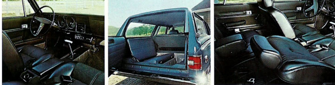
Toyota Crown Four-Door Sedan, Four-Door Wagon

ENGINE: 6 cyl. in line, SOHC, 7 main bearings. DISPLACEMENT: 137.5 cu. in. COMPRESSION RATIO: 8.8:1. HORSEPOWER: 115 @ 5,200 rpm. MAX. TORQUE: 123 ft. lb. @ 3,600 rpm. CARBURETOR: One downdraft, 2-barrel. TRANSMISSION: 4-speed synchromesh. Automatic transmission (optional): 3-speed. BRAKES: Discs in front. WHEELBASE: 105.9 in. WEIGHT: Sedan: 2,965 lbs. Station Wagon: 3,140 lbs. PERFORMANCE: Max. speed: 99 mph. Cruising speed: 87 mph.