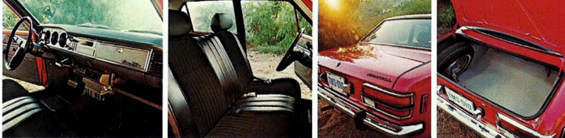
Toyota Corona Four-Door Sedan

ENGINE: 4 cyl. in line, OHC. DISPLACEMENT: 113.4 cu. in. COMPRESSION RATIO: 9.0:1. HORSEPOWER: 108 @ 5,500 rpm. MAX. TORQUE: 117 ft. lb. @ 3,600 rpm. CARBURETOR: One downdraft, 2-barrel. TRANSMISSION: 4-speed synchromesh. Automatic transmission (optional): 3-speed. BRAKES: Power braking system with front discs. WHEELBASE: 95.7 in. WEIGHT: 2,170 lbs. PERFORMANCE: Max. speed: 105 mph. Cruising speed: 85 mph.