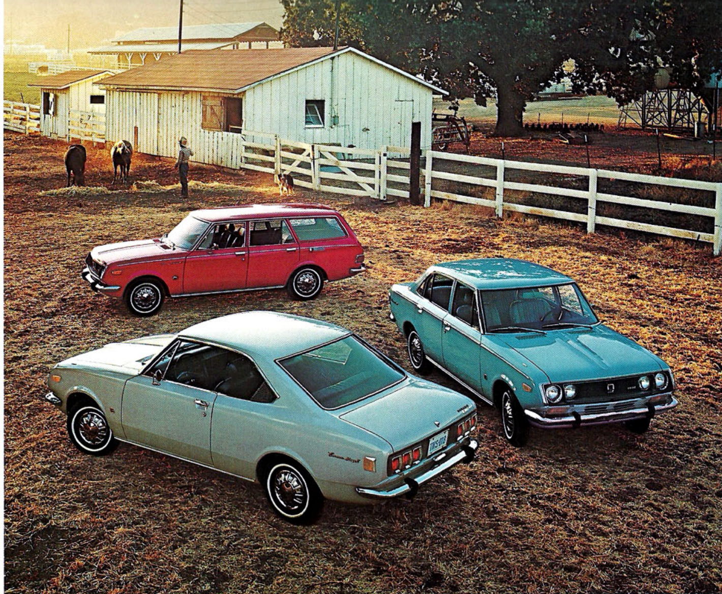
Toyota Mark II Hardtop, Four-Door Wagon, Four-Door Sedan

ENGINE: 4 cyl. in line, SOHC. DISPLACEMENT: 113.4 cu. in. COMPRESSION RATIO: 9.0:1. HORSEPOWER: 108 @ 5,500 rpm. MAX. TORQUE: 117 ft. lb. @ 3,600 rpm. CARBURETOR: One downdraft, 2-barrel. TRANSMISSION: 4-speed synchromesh. Automatic transmission (optional): 3-speed. BRAKES: Discs in front. WHEELBASE: 98.8 in. WEIGHT: Hardtop: 2,310 lbs. Sedan: 2,310 lbs. Station Wagon: 2,430 lbs. PERFORMANCE: Max. speed: 105 mph. Cruising speed: 85 mph.