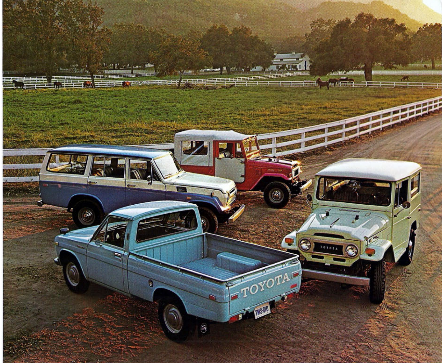
Toyota Land Cruiser Wagon, Vinyl Top, Hardtop. Foreground: Toyota Half-Ton Pickup

ENGINE: 4 cyl. in line, OHV. DISPLACEMENT: 113.4 cu. in. COMPRESSION RATIO: 9.0:1. HORSEPOWER: 108 hp @ 5,500 rpm. MAX. TORQUE: 117 ft. lb. @ 3,600 rpm. CARBURETOR: One downdraft, 2-barrel. TRANSMISSION: 4-speed synchromesh. WHEELBASE: 99.8 in. CURB WEIGHT: 2,440 lbs. GROSS WEIGHT: 3,840 lbs.