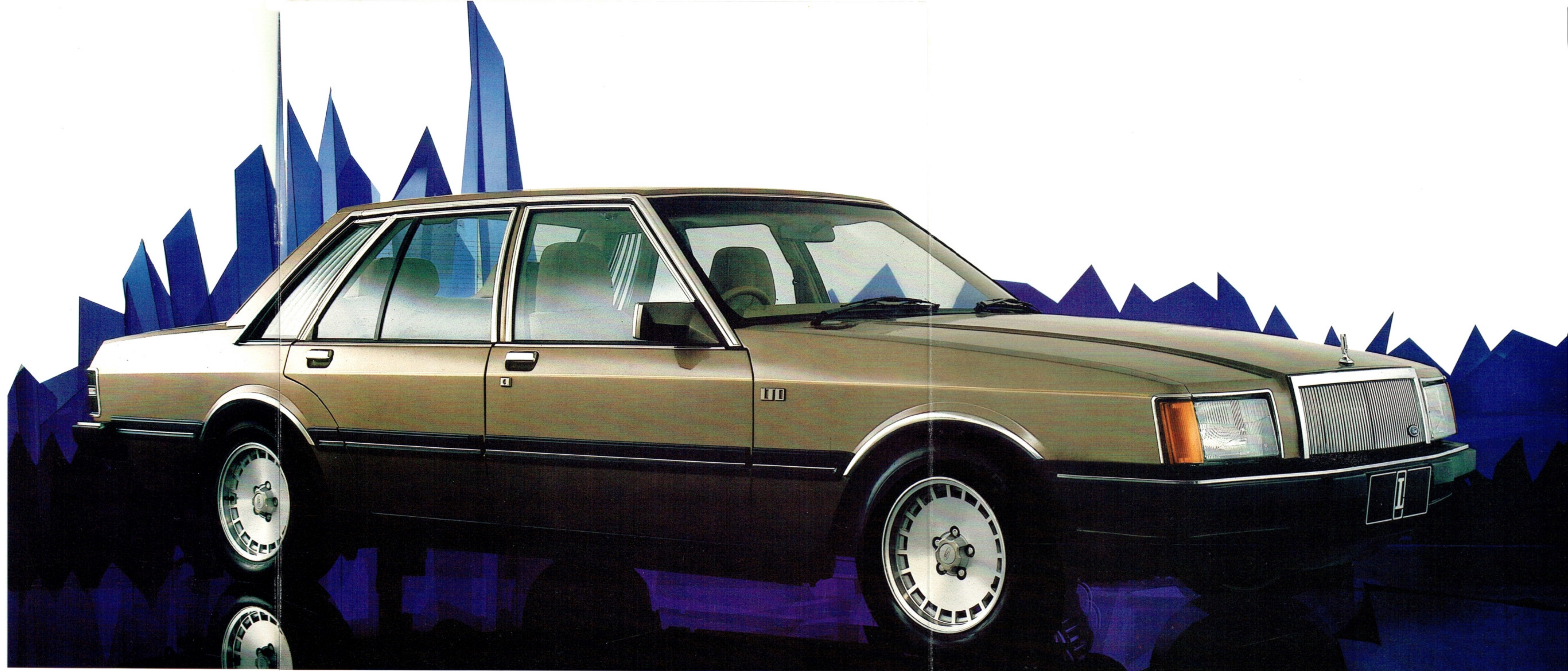
The 'spectral map' used as a background to the illustration of the car indicates frequencies of sound inside the car.

A short drive in the new Ford LTD will suffice to prove to your ears and to you that in this modern world there are few places offering the peacefulness of the inside of an LTD.