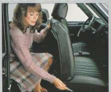
Cover: Le Car 4-door Deluxe. A: Le Car 2-door Deluxe shown with sun roof, ski rack B through G: Le Car Sports Package including custom sport striping, "performance" check fabric trimmed buckets, Sport gear shift knob and boot, fog lights, styled aluminum wheels, sports steering wheel and electric tachometer. H: Le Car Deluxe instrument panel with available air conditioning and AM/FM stereo radio. I: Swing out rear quarter windows on 2-door Deluxe models. J: Standard buckets tilt forward. (2-dr. only.)