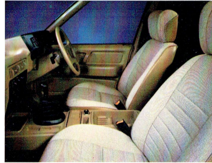
Interior of GL Ute featuring cloth covered seats and centre console.