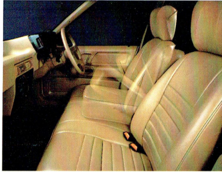
Interior of Standard Ute featuring Centafold seat.

But your Falcon ute also has to work hard. There's plenty of carrying room. The floor panels are corrugated and reinforced. And the sides are doubled panelled - ready for the tough jobs.