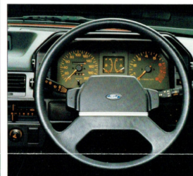
Comprehensive sports instrumentation