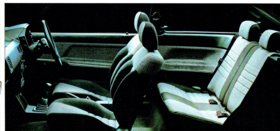
The interior styling will make your pulse go fast.

The driver's seat has thick side supports and adjusts six ways to cater for your preferred driving position. The 50/50 split rear seat back, with six position recline and vertically adjustable head restraints, provides enormous versatility in seating and luggage capacity. TX3's moulded rear quarter panel trim has integrated armrests.