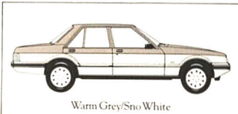
Warm Grey/Sno White