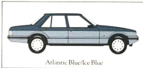
Atlantic Blue/Ice Blue