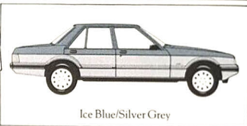
Ice Blue/Silver Grey

mounted automatic transmission with all the power and economy of the proven 3.3 litre Alloy Head II Engine. The 4.1 litre engine is available at extra cost on the 'Family Edition.'