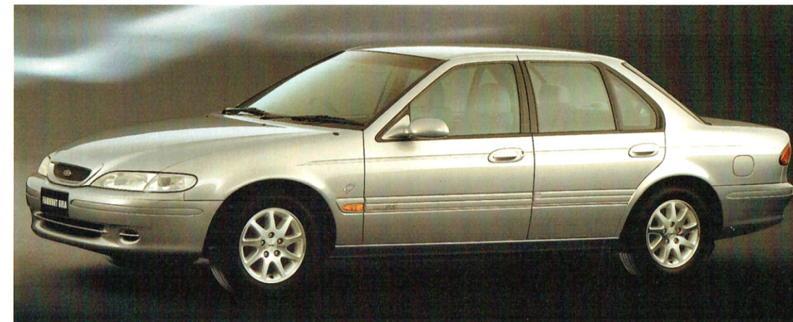
FAIRMONT GHIA An executive package with all the fringe benefits. Fairmont Ghia admits you to a world of luxurious appointments, rich leather and abundant room.