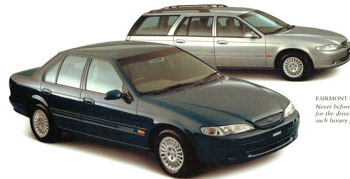
FAIRMONT SEDAN AND WAGON Never before has so much pleasure for the driver been combined with such luxury for the passengers.