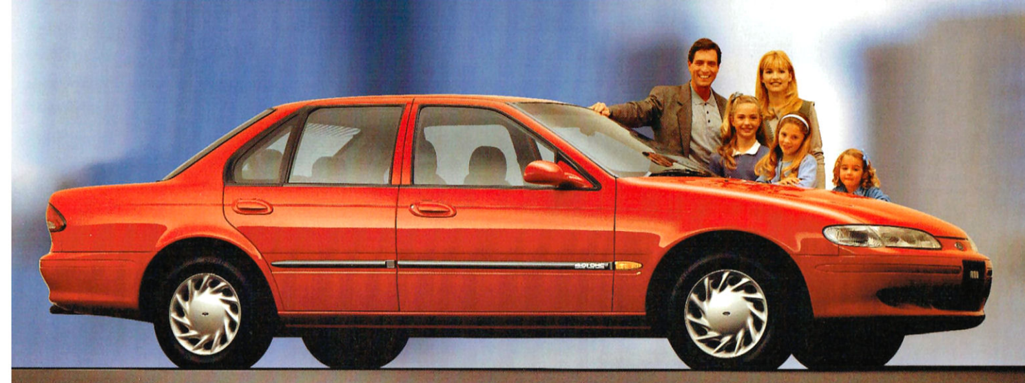
FALCON FUTURA SEDAN AND WAGON Ford Falcon Futura sedan and wagon occupy the high ground in safety, technology and performance. Futura is also the choice for a high level of standard equipment and the kind of quality finish you can see and feel.