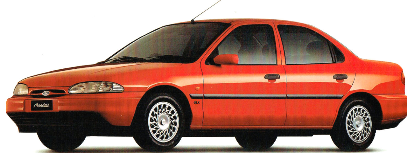
MONDEO SEDAN, HATCH AND WAGON Mondeo won the 1994 European Car of the Year award. One drive of the Mondeo sedan, hatch or wagon and you'll see why. With high levels of equipment, standard driver's airbag, and ride and handling in the European tradition, every Mondeo gives you a lot of car for your money.