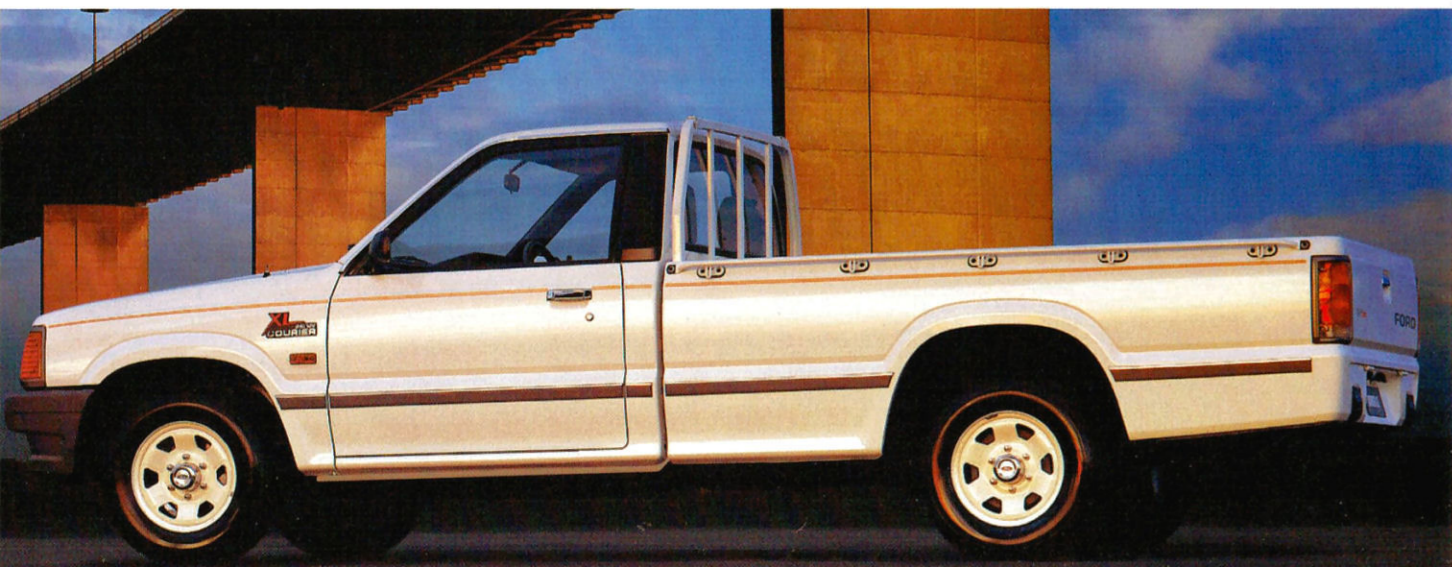
COURIER 2WD Class-leading power in a Pick-up, Crew Cab, Super Cab or Chassis Cab. The big hearted workhorse for around town or in the bush.