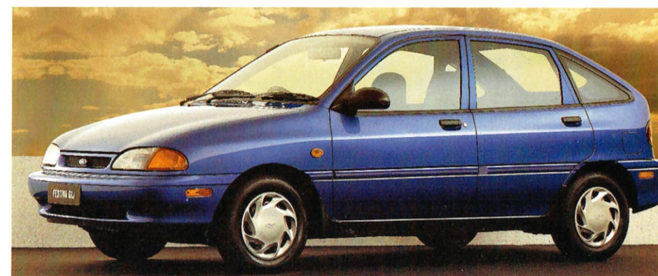
FESTIVA GLI A powerful fuel injected engine. Outstanding road manners. The five-door Festiva GLI is the small car that's not afraid of the open road. Call it your escape hatch.