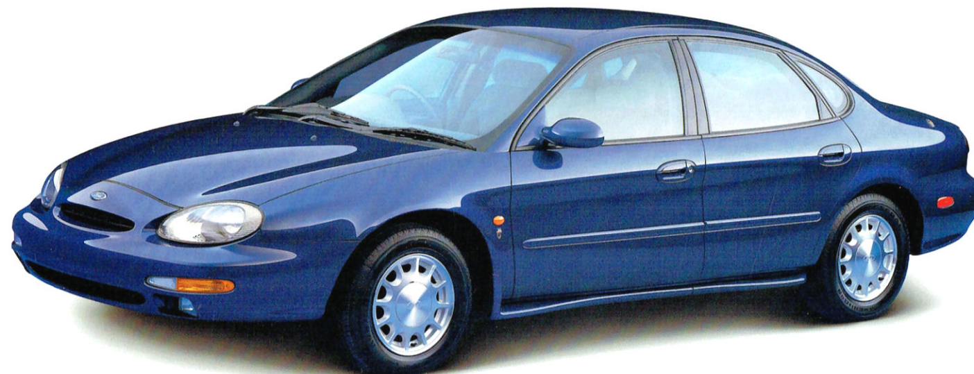
TAURUS GHIA A design you've never seen, from a name you know well. Indeed, new Taurus Ghia is an inspiration by design. Powered by a 3.0 litre 24-valve DOHC Duratec V6 engine that delivers 149 silky kW and, under normal driving conditions and with routine filter and fluid changes, has its first scheduled engine tune-up at 150,000 km.