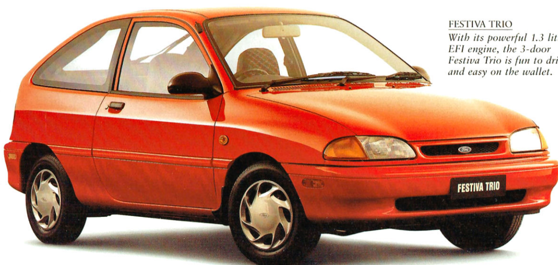
FESTIVA TRIO With its powerful 1.3 litre EFI engine, the 3-door Festiva Trio is fun to drive and easy on the wallet.