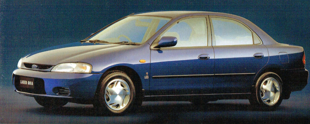
LASER GHIA SEDAN Laser has been a trusted name in Australian motoring for more than a decade. Today's Laser Ghia Sedan, in that tradition, is making a bunch of new friends while continuing to impress long standing Laser devotees.