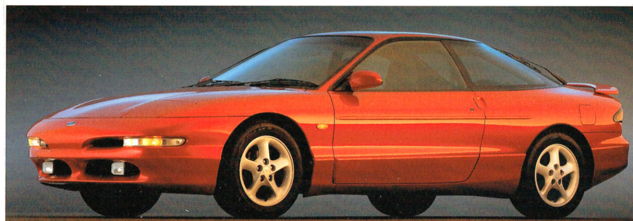
PROBE A 2.5 litre V6 engine, with 24 valves and electronic fuel injection. Anti-lock brakes and a ground-bugging stance. Ford Probe. A beautiful body. And a passionate soul.