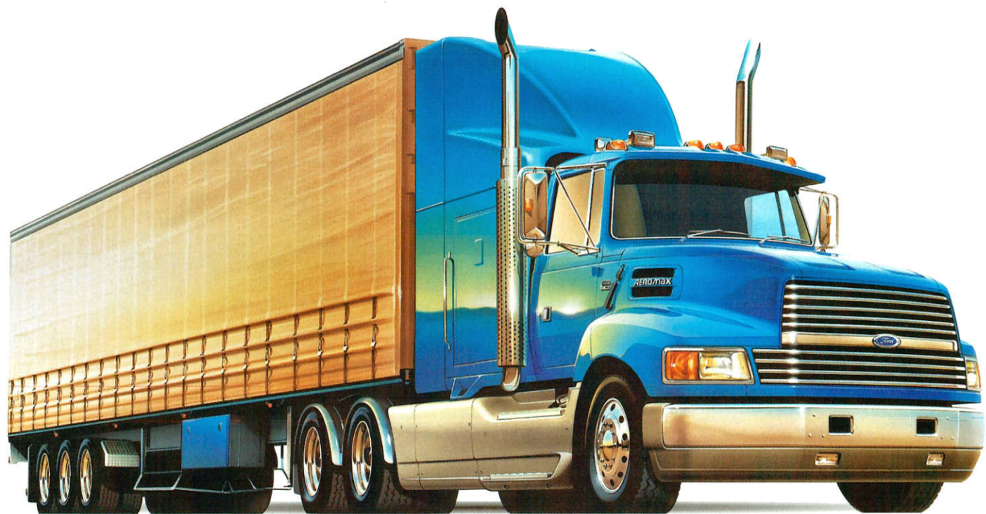
LOUISVILLE AEROMAX 120 Never before has a conventional big Ford ever delivered so much. It's the most aerodynamic and fuel efficient big Ford ever - and the best handling and smoothest riding.