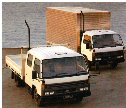
TRADER Truckers love Traders - and there are seven models to choose from, ranging from 2 to 4 tonnes, every one with power steering.