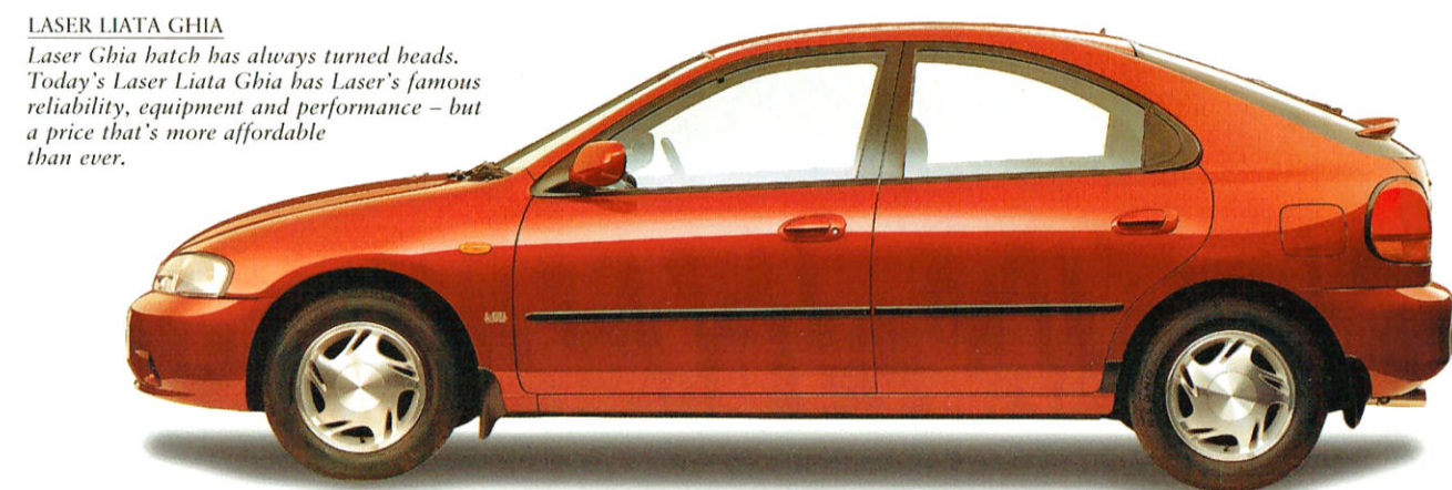
LASER LIATA GHIA Laser Ghia hatch has always turned heads. Today's Laser Liata Ghia has Laser's famous reliability, equipment and performance - but a price that's more affordable than ever.