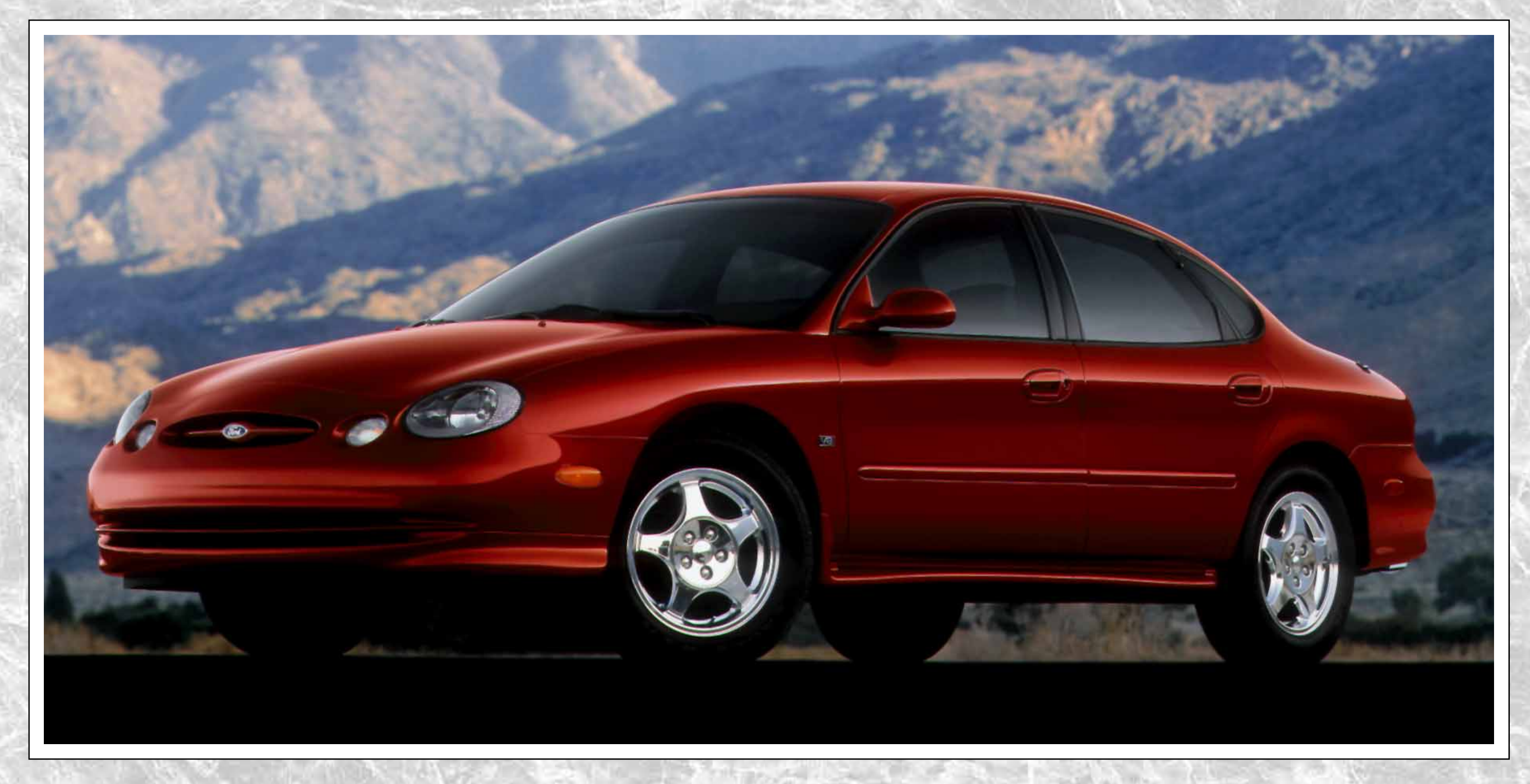
The shape has taken a provocative new turn. The spirit is still full speed ahead.