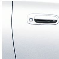
SUPER WHITE 1