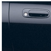
CARBON BLUE 3