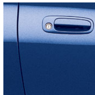
SPECTRA BLUE MICA 3