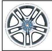
GT standard 15" wheel cover GT available 15" aluminum alloy wheel