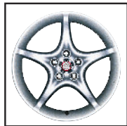
GT-S standard 15" aluminum alloy wheel GT-S available 16" aluminum alloy wheel