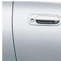
LIQUID SILVER METALLIC 1