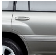
Thunder Cloud Metallic with Shadow Gray Interior