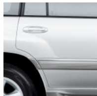
Natural White with Ivory or Shadow Gray Interior