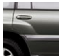
Riverrock Green Mica with Ivory or Shadow Gray Interior