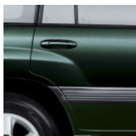
Imperial Jade Mica with Ivory or Shadow Gray Interior