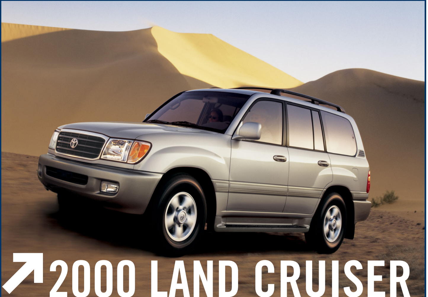
Land Cruiser shown in Atlantis blue Mica.