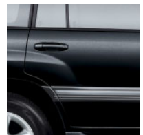
Black with Ivory or Shadow Gray Interior