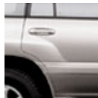
CHampagne Pearl with Ivory or Shadow Gray Interior