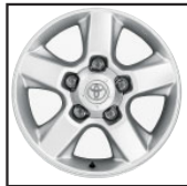
Available 5-spoke aluminum alloy wheel